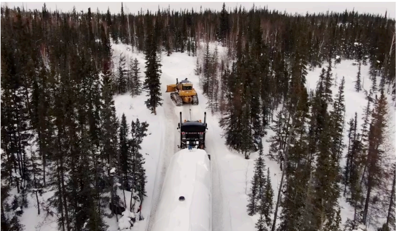
Figure 4: Fuel tank being transported along Nechalacho project road