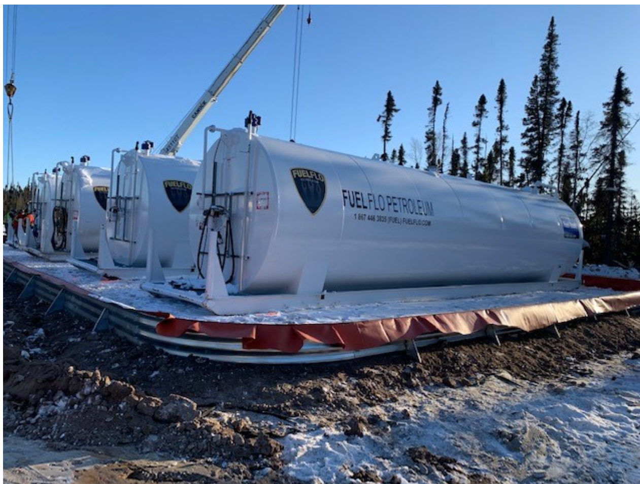
Figure 5: Completion of the installation of the fuel farm to service mining operations