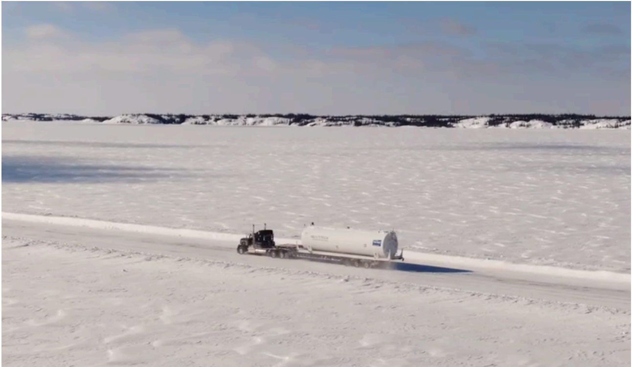
Figure 3: Fuel tanks being mobilised across the Nechalacho Ice Road