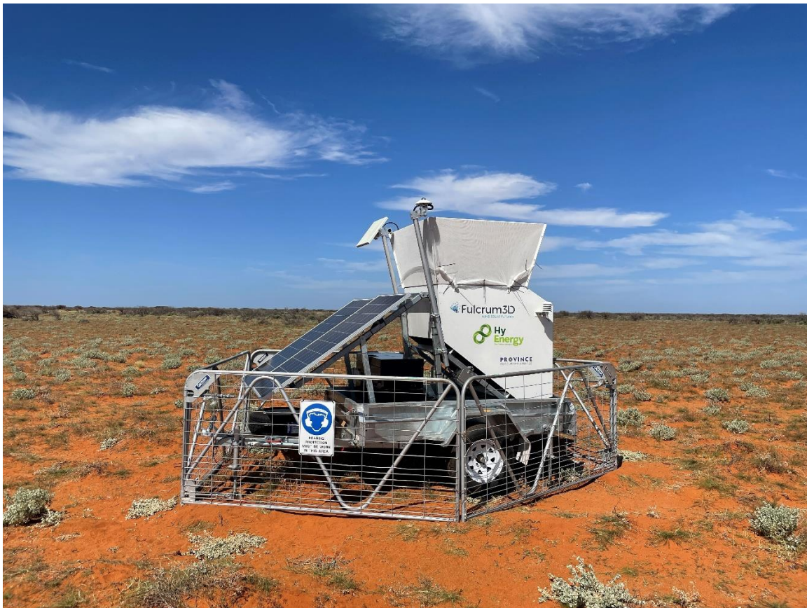
Figure 1. Fulcrum3D Sodar trailer mounted wind and solar monitoring station installed at the HyEnergy Project.