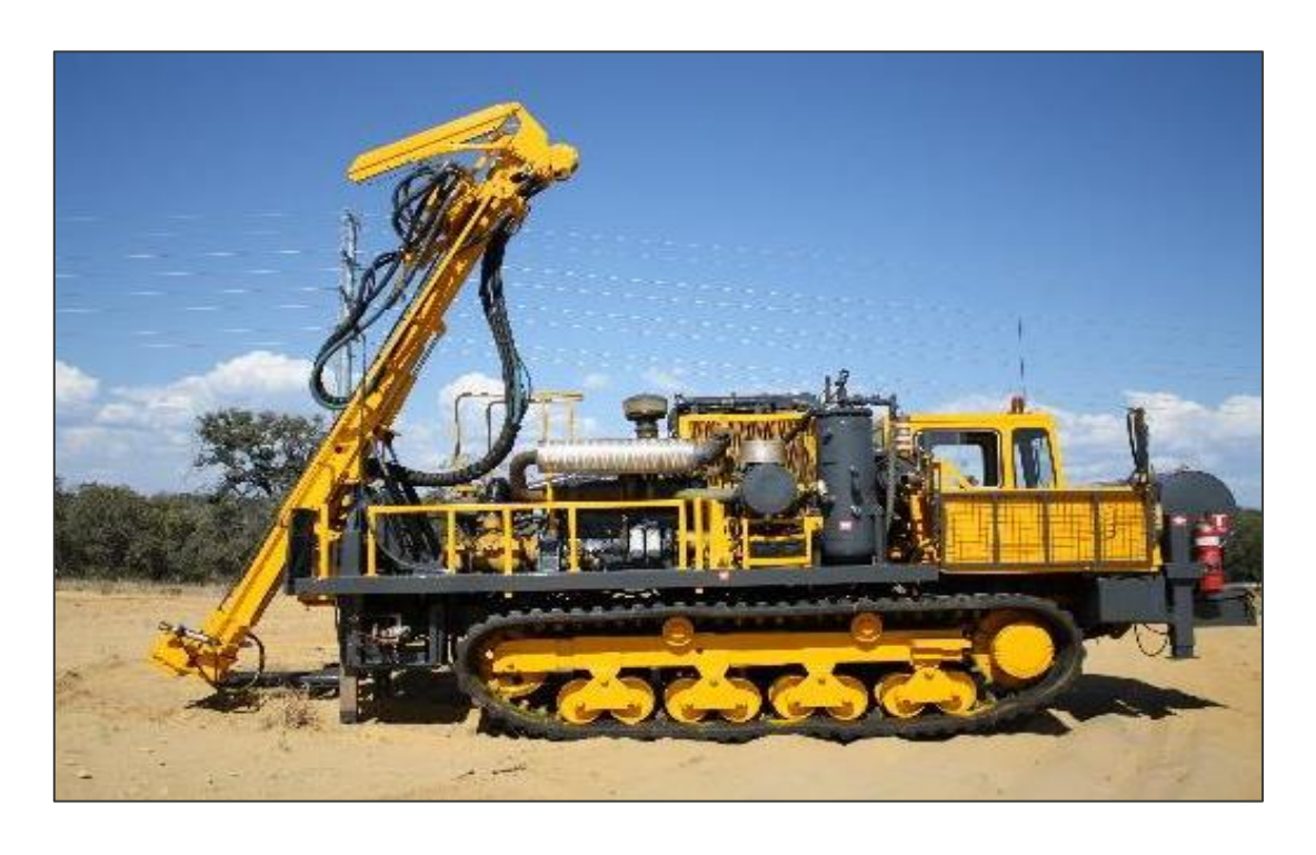
Figure 2 – KL150 Aircore Rig currently on site in the Pilbara