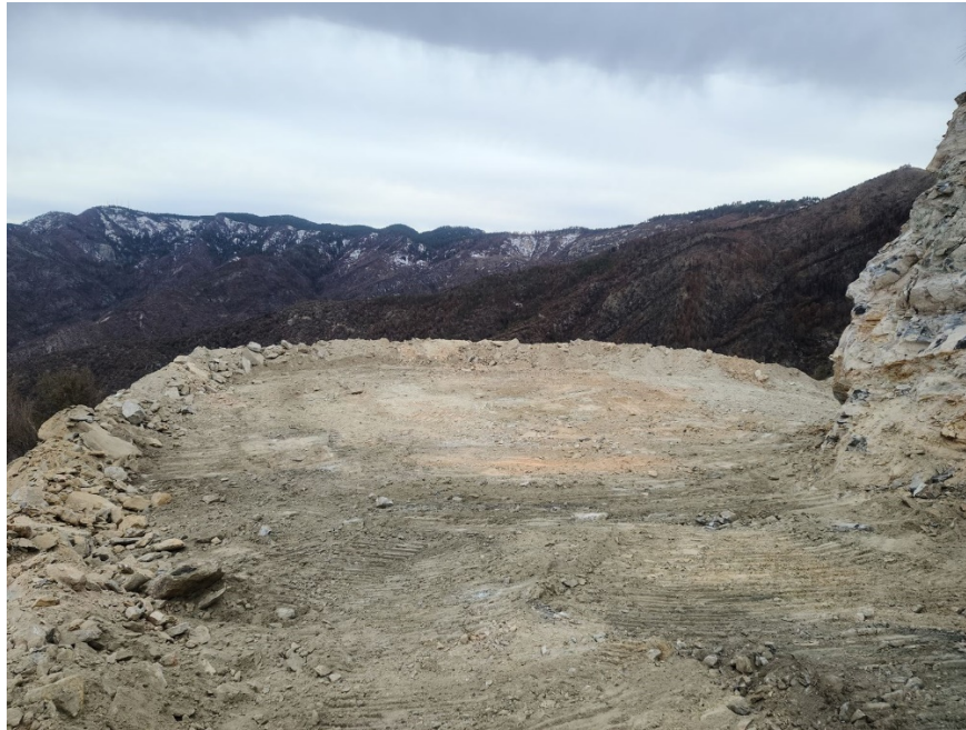
Figure 2 - Completed new pad in South Zone ready for the additional drilling rig

Eagle Mountain Mining is well funded for the planned acceleration of drilling and exploration activities following the capital raising of $11 million announced in February 2021. This includes funds of $2 million from an entity associated with Mr Charles Bass, which is subject to shareholder approval and will be considered at the Company's General Meeting to be held on 30 April 2021.