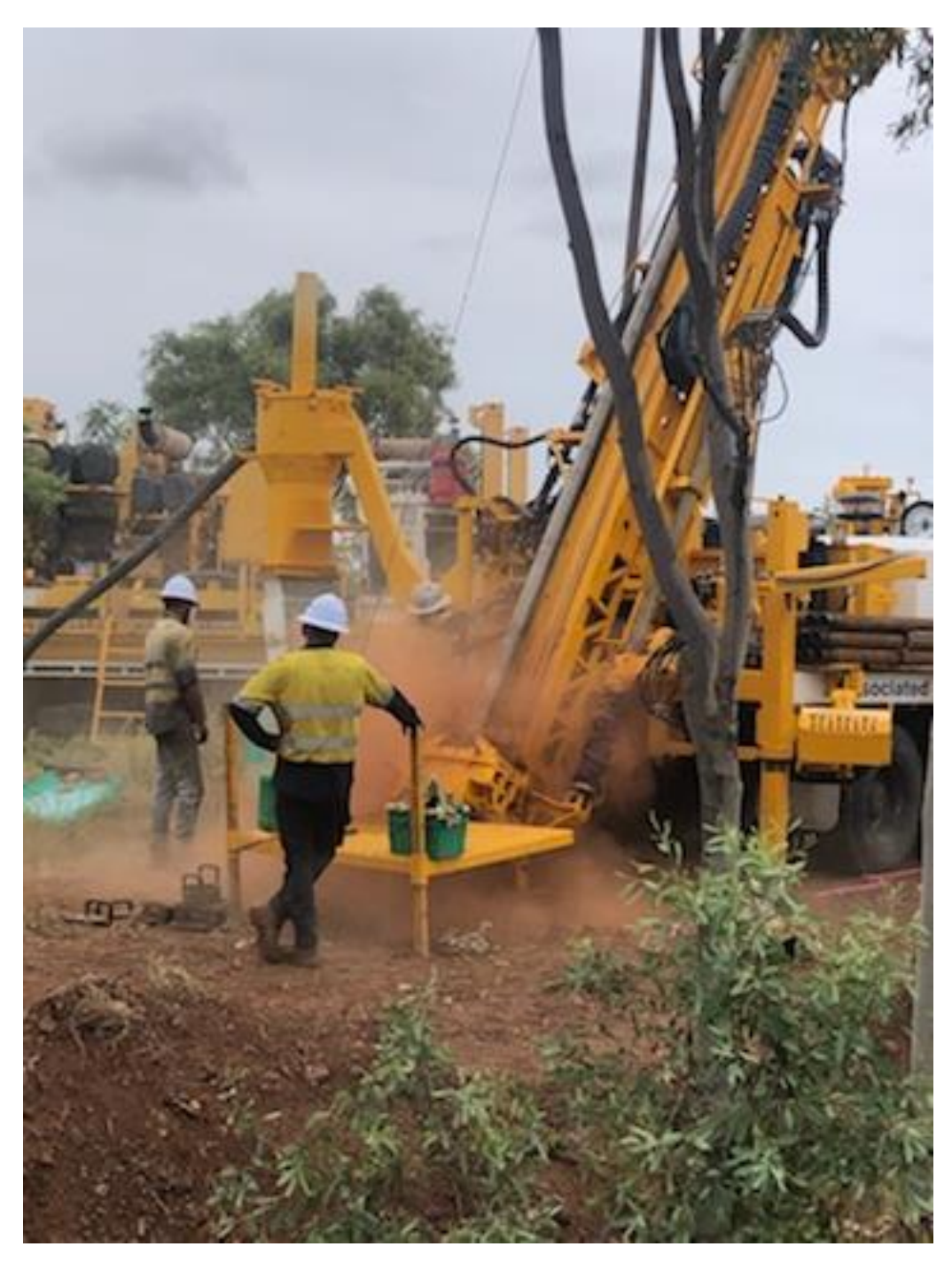
Figure 1: Drilling underway at Lucky Break.