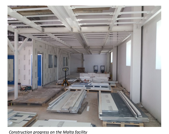
Ventilation system at the Malta site