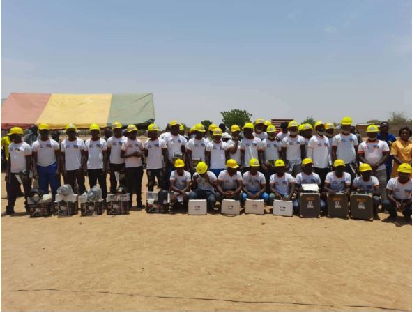
Closing ceremony for retraining courses for former artisanal miners.