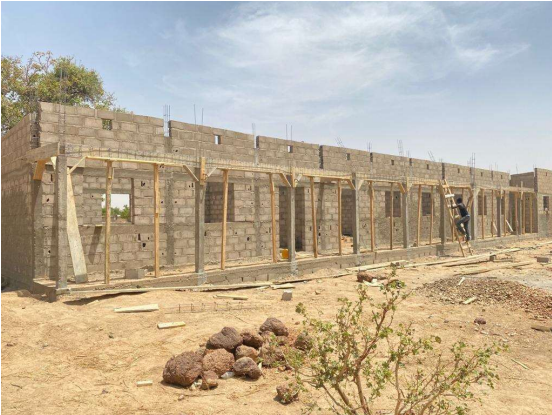
New school under construction by WAF.