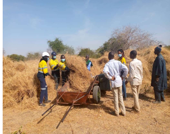
Distribution of livestock feed to local communities.