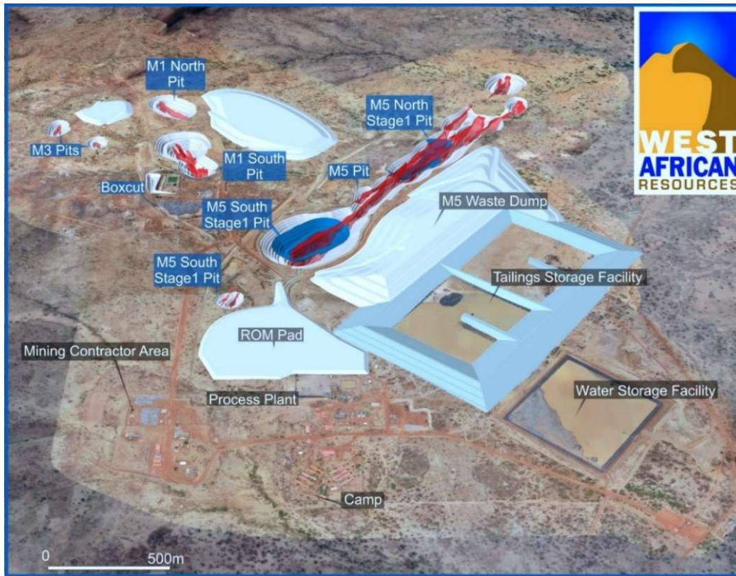
Figure 1: Sanbrado Gold Operation Layout