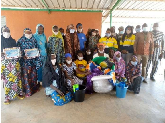
Local women receiving certificates and materials at the completion traditional weaving and dyeing training.