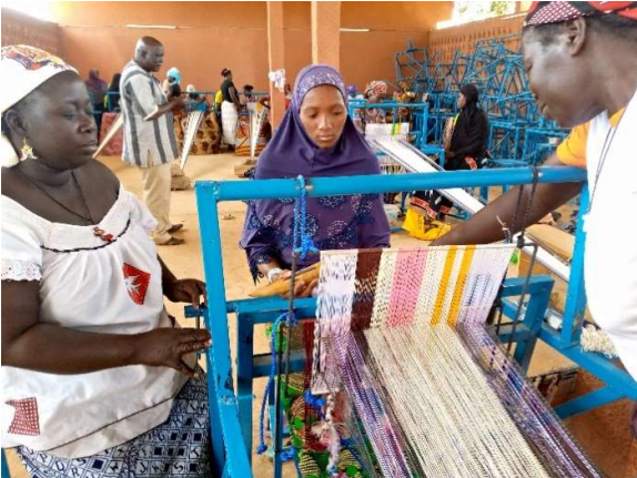
WAF’s former core handling yard now repurposed as a Community Centre – Local women shown are being trained in traditional cloth weaving.

Activities from some of the recent Company initiatives are shown in the photographs below.