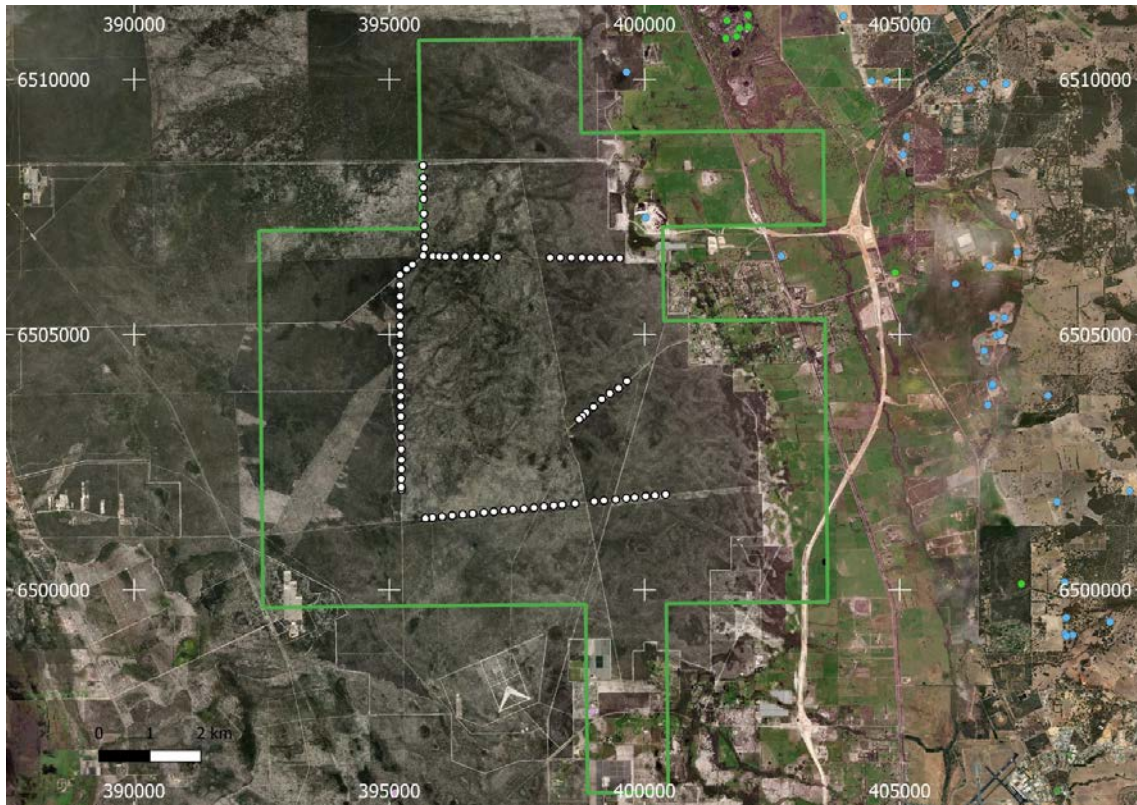
Figure 2: Drill Collar Plan

A total of eighty-two aircore drill holes (78 drill holes to depth of 10m and 4 to depth of 15 to 20m) were drilled at nominal 200m spacing on six drill lines along existing tracks (as shown in Figure 2 below within the Tenement area). The drilling locations were located using hand held GPS.