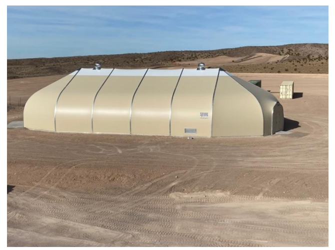
Figure 1 | Photo of Site Infrastructure

Construction activities are progressing for the Fort Cady Borate Mine with important equipment due on site over the coming two months. Difficulties associated with COVID-19 and global shipping have made timelines more complicated. Notwithstanding this, the Company still expects first production associated with initial commissioning to occur in September 2021, with meaningful production in Q4 CY2021.