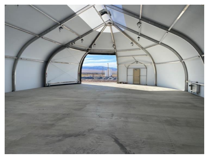
Figure 2 | Photo of Site Infrastructure