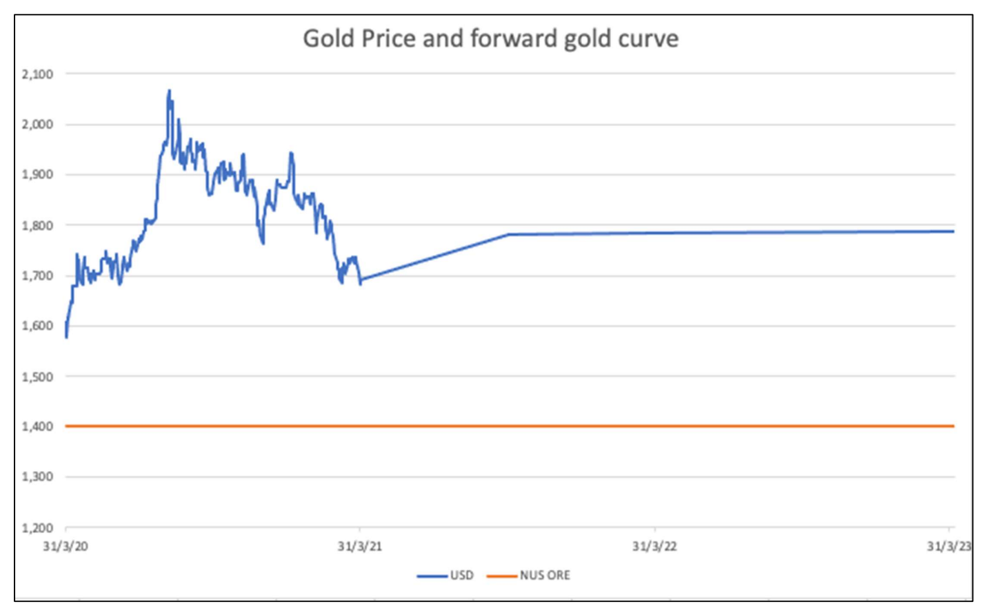
Figure 2: Gold price April 2020 to March 2023 (IRESS data), compared with the gold forward curve (LME) and the gold price assumption underpinning Nusantara's Reserves (US$1,400/oz)