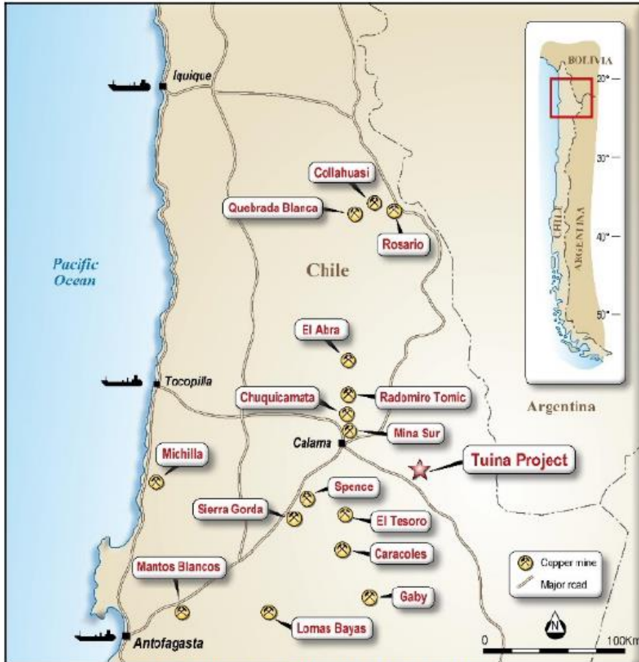
Location of Tuina Project in Chile