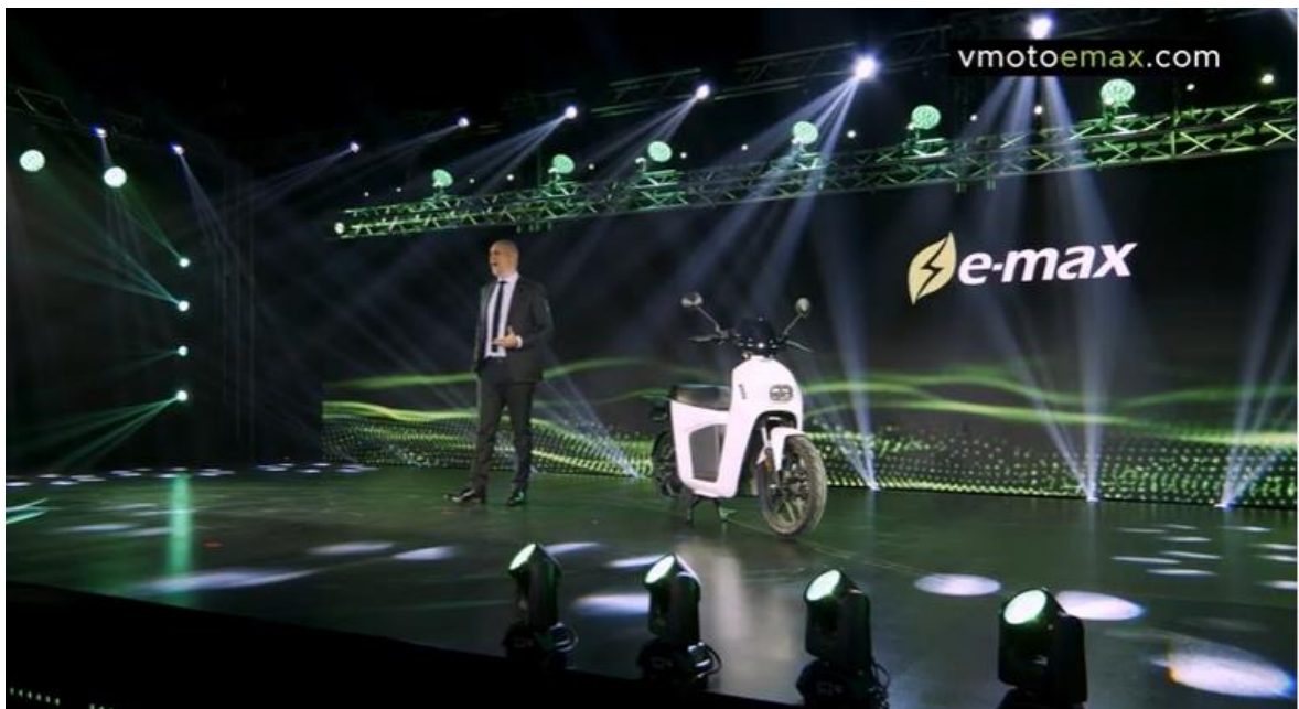
Photo: The B2B electric delivery moped, e-max VS2, unveiled at the 2021 e-max World Première

On 20 April 2021, Vmoto also expanded its B2B product offering with the launch of new B2B electric two-wheel vehicle model, e-max VS2, unveiled at the 2021 e-max World Première.