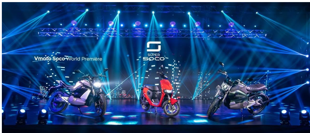
Photo: Three new B2C electric two-wheel vehicle models, unveiled at the 2021 Vmoto Soco World Première