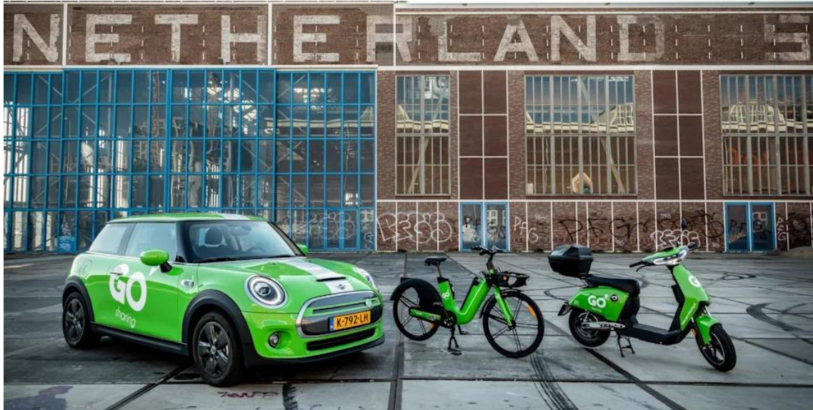
Photo: GO Sharing's ride-sharing e-moped with ambitions to add electric cars and e-bikes to its app and vehicle sharing operations.

GO Sharing, which has a fleet of around 5,000 e-mopeds across 30 cities in three countries, the Netherlands, Belgium and Austria, plans to use the funding to expand its footprint for e-mopeds, add electric cars and e-bikes to its app, expand ride-sharing operations further into the United Kingdom and Turkey, and continue building out the technology underpinning it all.