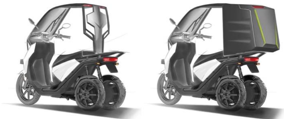
Photo: The conceptual design for the Company's new B2B electric three-wheel delivery vehicle, VS3, under development.