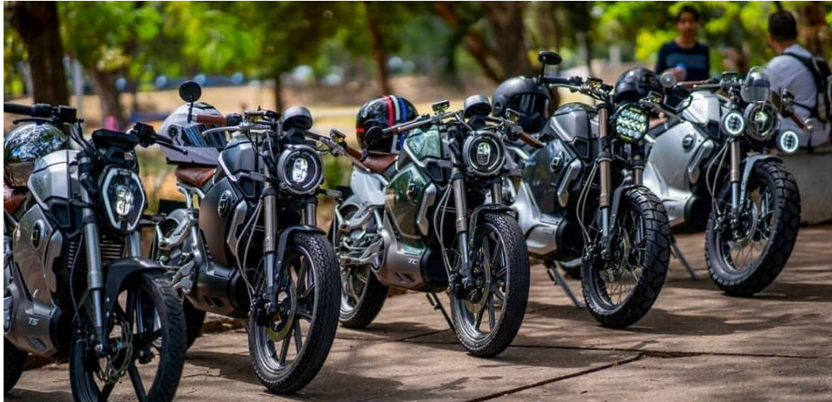
Photo: Increased interest and recognition among motorcycle enthusiasts and other consumers for Vmoto's B2C products

B2B ride-sharing markets: The Company is now supplying products to seven ride-sharing operators globally and is in advanced discussions with an additional fifteen ride-sharing operators.