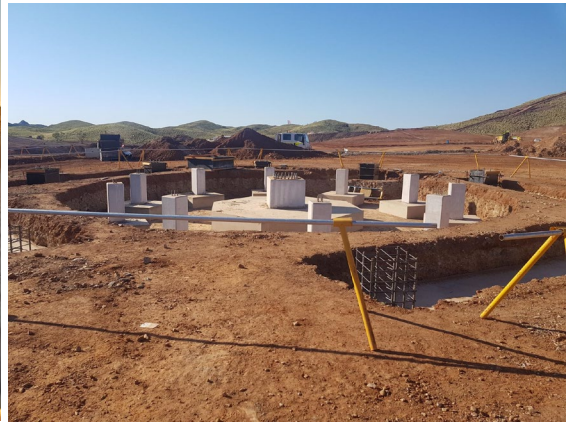
Figure 5: Thickener Pedestals