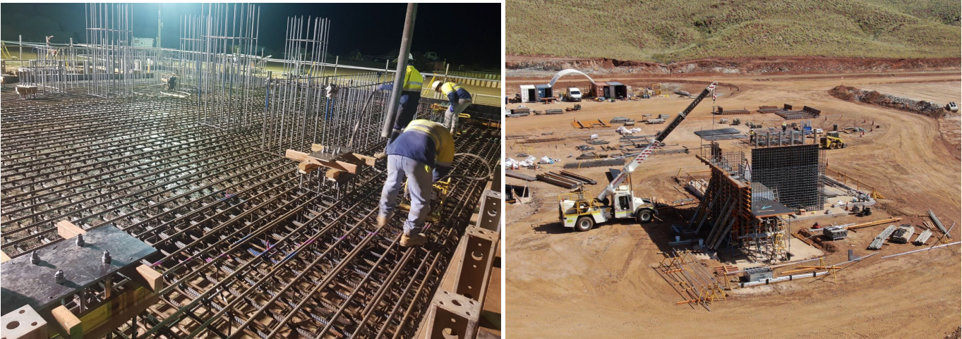
Figure 2: Mill Foundations