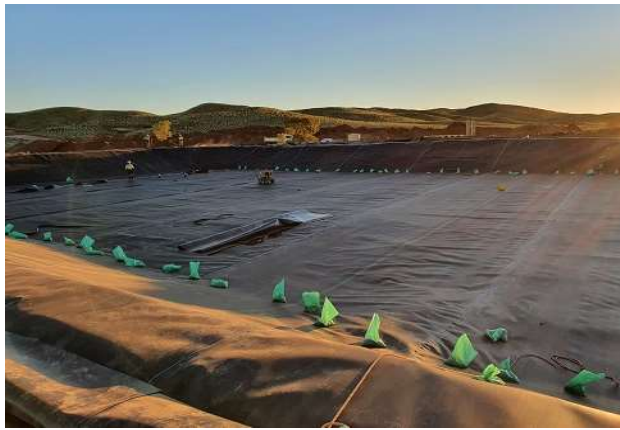
Figure 4: Turkey's Nest under construction