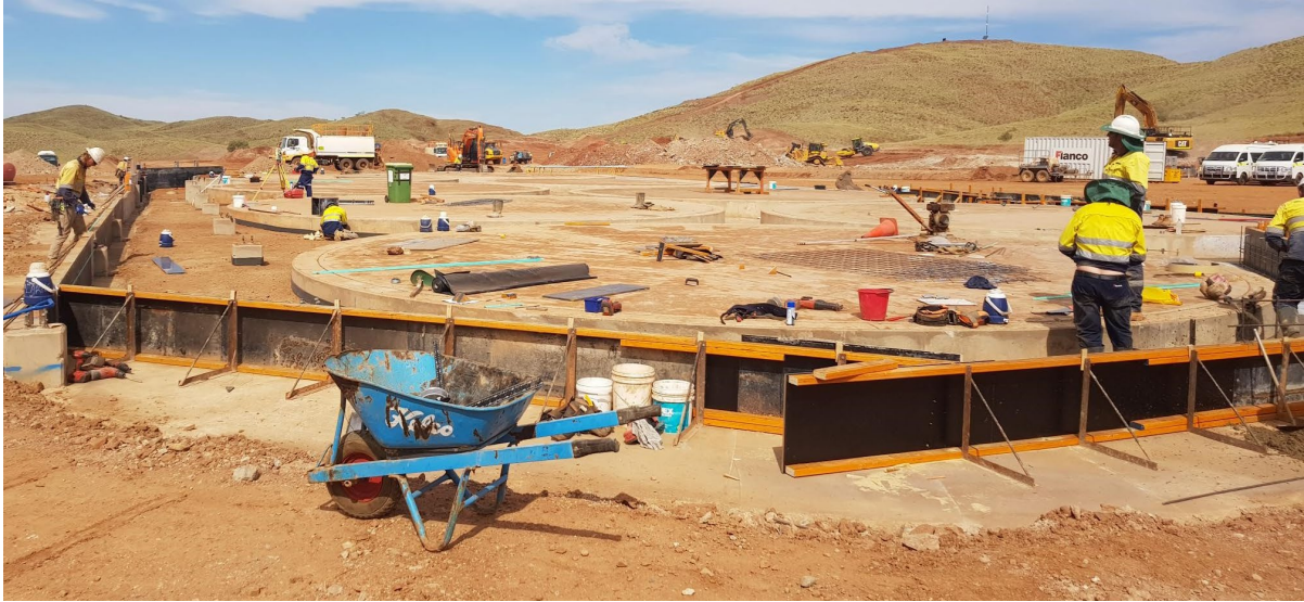
Figure 3: CIL Tank Bases