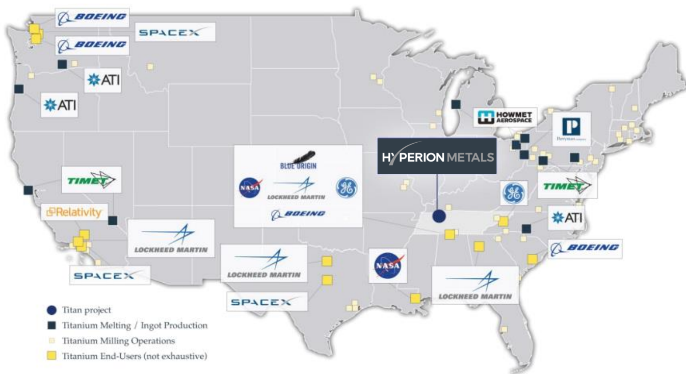
Figure 2: Titanium ingot producers and major U.S. aeronautic and space manufacturing facilities

Hyperion has signed an MOU to establish a partnership with Energy Fuels that aims to build an integrated, all-American rare earths supply chain. The MOU will evaluate the potential supply of rare earth minerals from Hyperion's Titan Project to Energy Fuels for value added processing at Energy Fuels' White Mesa Mill. Rare earths are highly valued as critical materials for magnet production essential for wind turbines, EVs, consumer electronics and military applications.