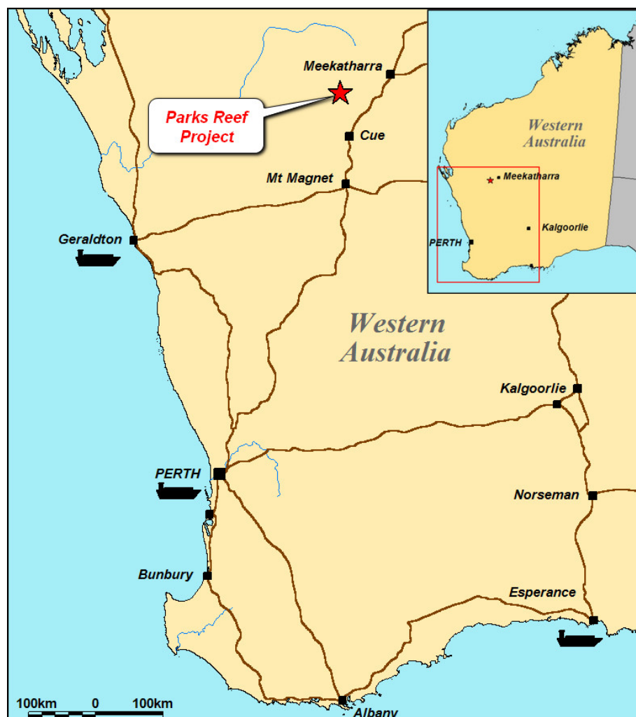
Location of Parks Reef PGM Project

We are targeting high value metals with strong market fundamentals and growth prospects with a strategy to rapidly develop an alternative supply of PGMs to the world market.