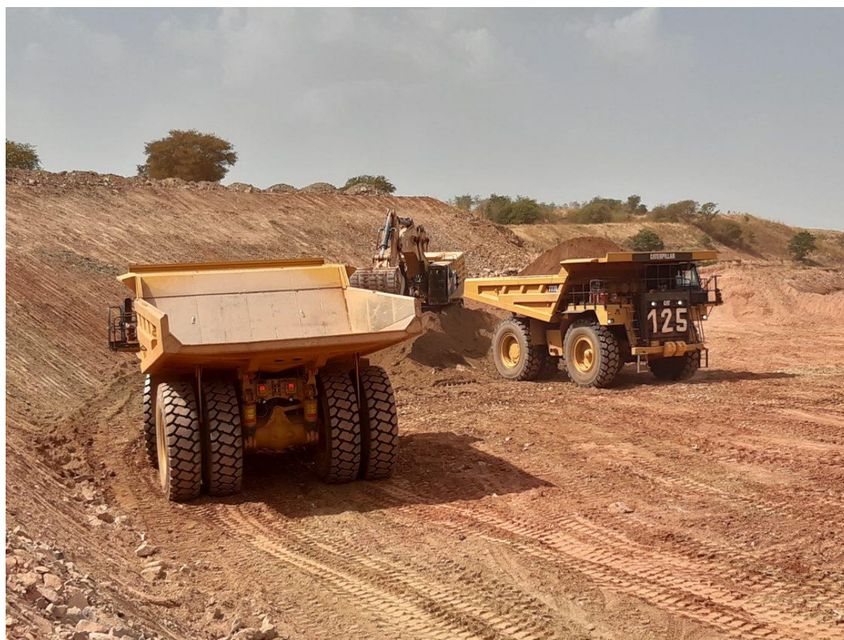
Figure 1. Mining Operations at Morila Pit 5.

Mining is underway at Morila Pit 5 (Figures 1 & 2), a mining area located on the western margin of the Morila Super Pit (Figure 3). Malian owned and operated contractor EGTF have mobilised a new 100 tonne class fleet, completed all mining preparatory works including re-establishment of the haul road to the crushers, and commenced mining and haulage to the crusher run of mine (RoM) stockpiles.