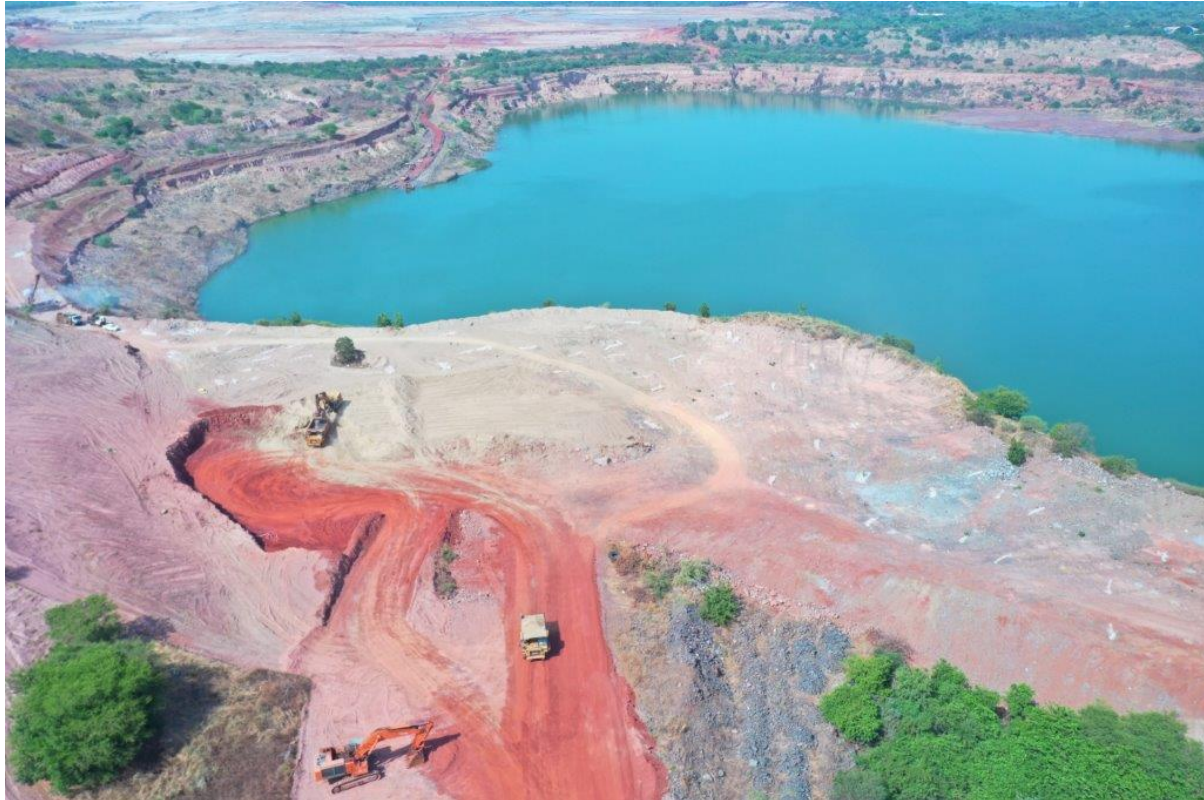
Figure 2. Aerial photograph of mining operations at Morila Pit 5.

"It is very exciting to be off and running with our first open pit mining operation at Morila. The location of Pit 5 right next to our operating processing plant, combined with recent drilling results that enhanced economics, made it a compelling opportunity to fast-track first production before we commence mining at our other satellite deposits. Importantly all the work has been undertaken safely, and it is very pleasing to have engaged the Malian owned and operated contractor EGTF, to resume mining at Morila Pit 5. Having taken these first steps, we of course remain very focussed on the main prize – bringing the Morila Super Pit back into operation."