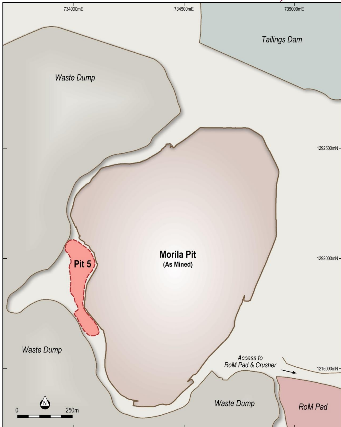
Figure 3. Location of Morila Pit 5 relative to the Morila Mine and infrastructure.

This announcement contains certain forward-looking statements with respect to Firefinch’s financial condition, results of operations, production targets and other matters that are subject to various risks and uncertainties. Actual results, performance or achievements could be significantly different from those expressed or implied by those forward-looking statements. Such forward-looking statement are no guarantees of future performance and involve known and unknown risks, uncertainties and other factors beyond the control of Firefinch that may cause actual results to differ materially from those expressed in the forward-looking statements in this announcement.