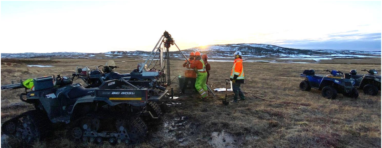
Figure 2: ATV-mounted Power-Auger drill at Window Glass Hill

With new exploration work programs ramping up every week, this promises to be an extremely busy period for the Company on multiple fronts”.