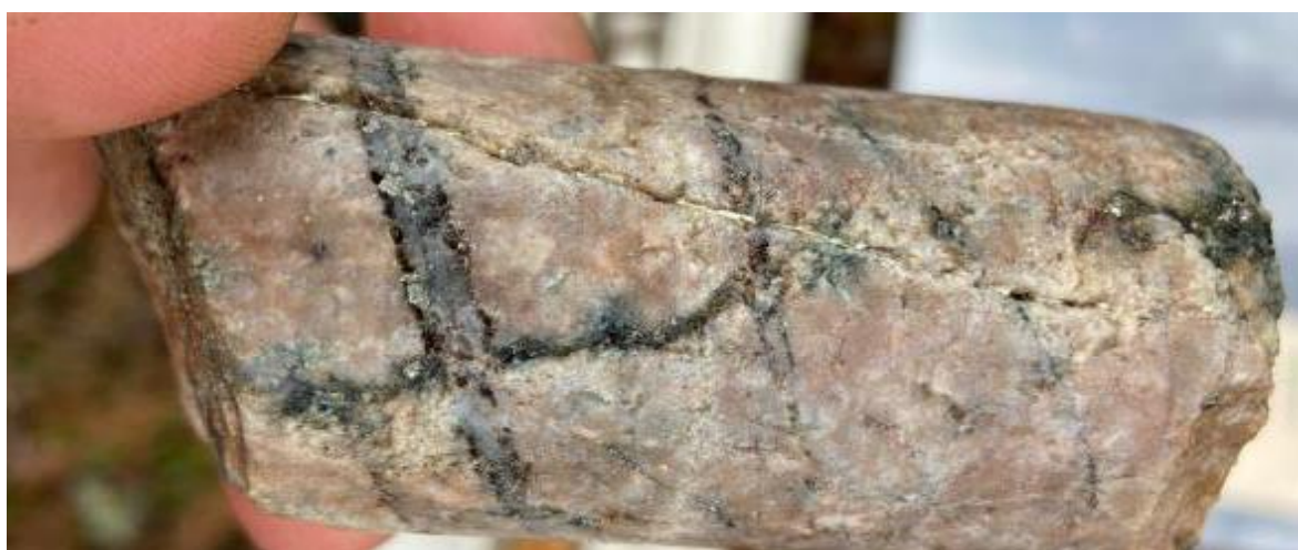
Figure 1: Bottom of hole core from Power-Auger drill hole 5717 showing typical WGH-style vein assemblages - from a previously untested area of the Window Glass Hill Granite