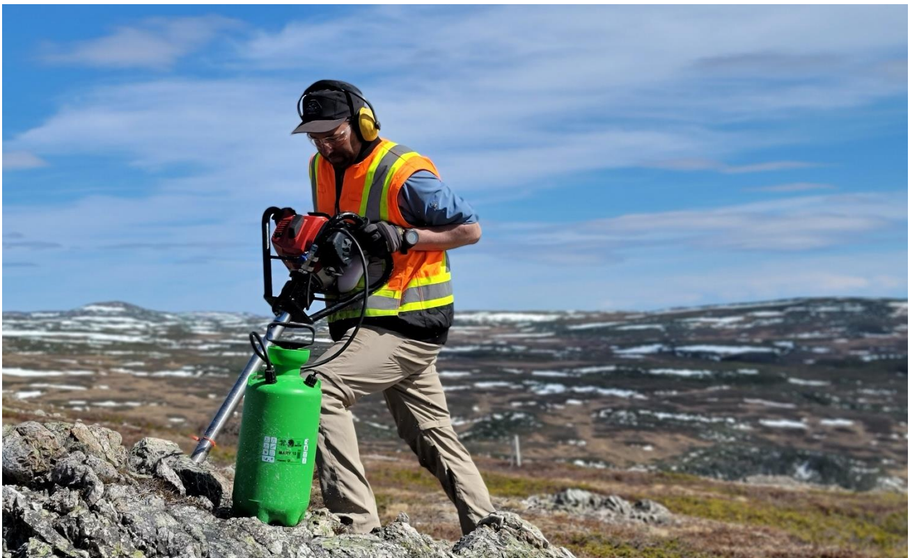
Figure 3: Hand-held Power-Auger Sampling Outcrop