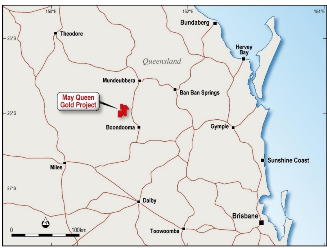
Figure 2: May Queen project location

Bundaberg and 375 km by road from Brisbane ( Figure 2 ). It covers free-hold land with no Native Title claim.