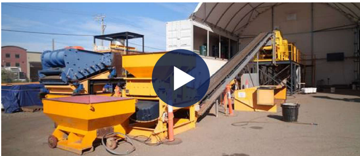
Figure 1: Video of Full-scale Ore Sorting facility being used as part of the trial testwork