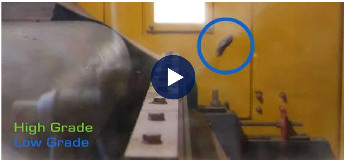
Figure 2: Low grade ore being rejected from testwork

We will continue to provide additional information on this trial work over the coming months."