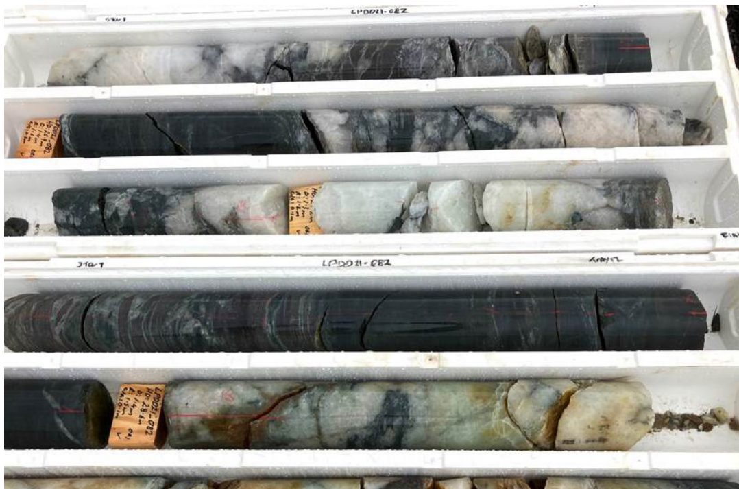
Hole LPDD21_082 from Lord Percy