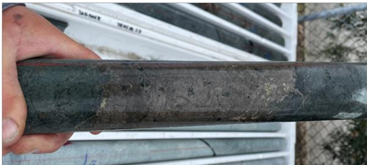
Figure 5. 20cm zone of massive sulphide at 130.8m in YAD0018.