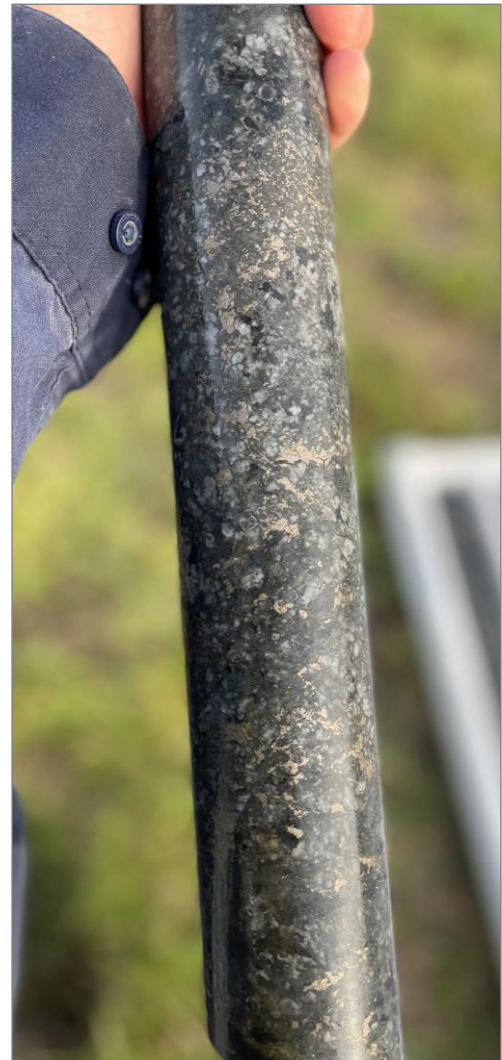
Figure 1. Coarse gabbro and sulphides at 271.6m in YAD0017.

“In the meantime, we are already planning the next work program. We are extremely grateful to have received a co-funded drilling grant through the WA Government Exploration Incentive