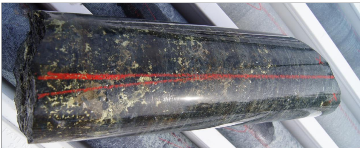
Figure 3. Disseminated chalcopyrite-rich sulphides at 70.5m in YAD0017.