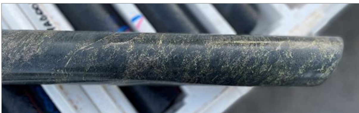
Figure 2. Disseminated to stringer chalcopyrite-rich sulphides at 308.8m in YAD0017.

The information in this announcement is based solely on a visual inspection of the drill core. The core is yet to be assayed and analysed. The Company has not confirmed whether PGE mineralisation is present, given that can only be determined through laboratory analysis. However, the presence of disseminated chalcopyrite is a characteristic of PGE mineralisation at Chalice Mining’s Julimar Project.