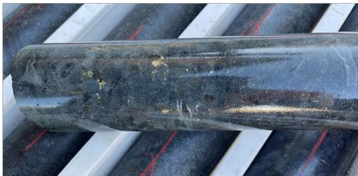
Figure 6. Disseminated blebby chalcopyrite at 161.8m in YAD0018.