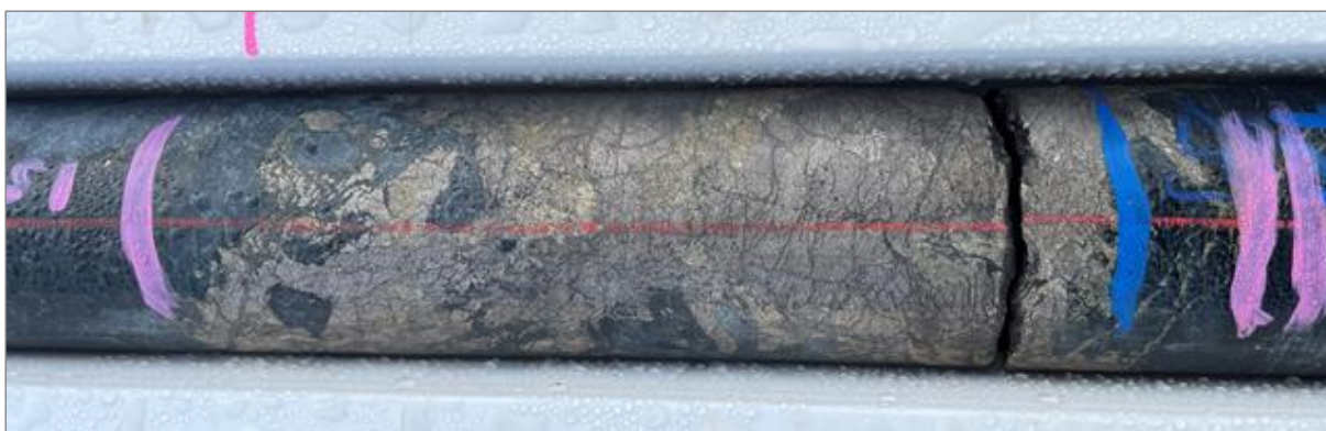
Figure 4. 20cm of massive sulphide at 156.1m in YAD0017.