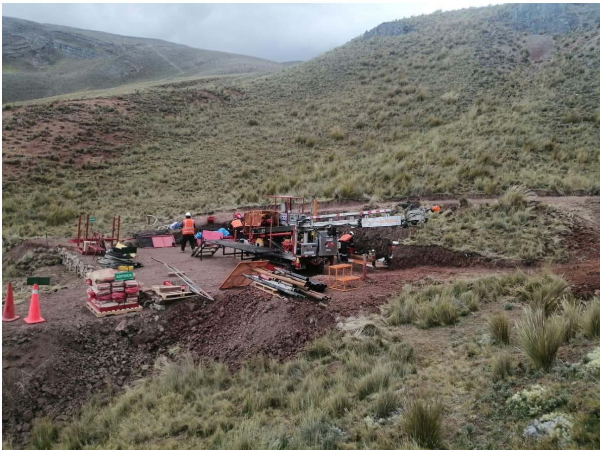
Photo 1: The general setup of platform one, hole number one. The terrain is relatively accessible with low to moderate grassy slopes. Weather conditions at present range from fair to wet. Drilling is not normally affected by the weather conditions. At the time of the photo drilling had not started.

The following photos were taken of the diamond core drill rig at platform one, drill hole one.