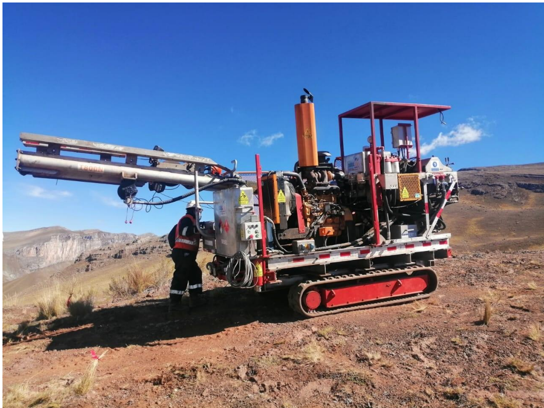
Photo 3: The drill rig whilst mobilising to the platform. As a highly manoeuvrable track-mounted rig, elaborate access tracks were not, and will not be required for most of the NE Area FTA drill program. Notwithstanding the compactness of the rig, diamond core drilling can reach depths of greater than 1,000m. The deepest hole in our program is 750m.