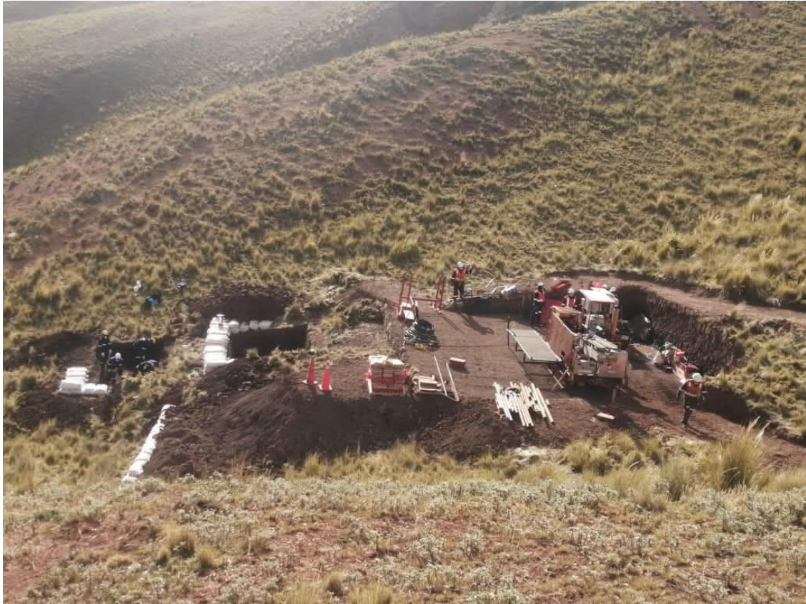
Photo 2: The general setup of platform one, hole number one, also showing the position of the sumps that collect and recycle the drill fluids. At the time of the photo drilling had not started.