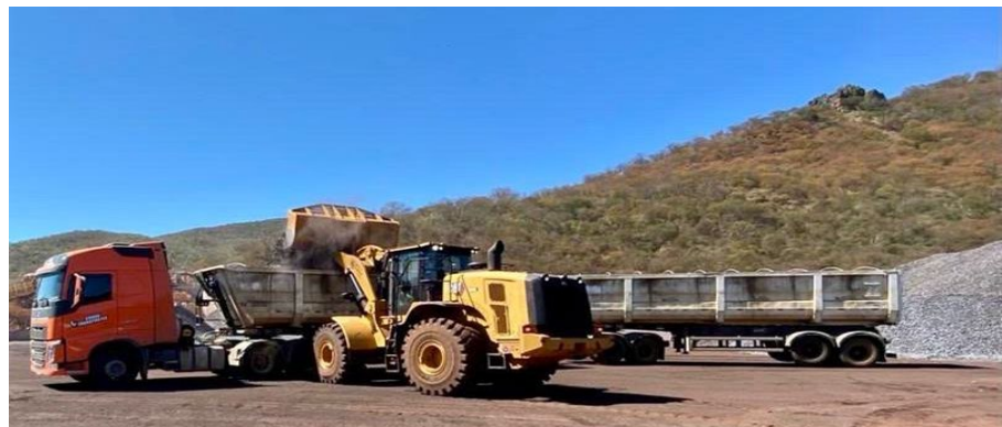
Figure 1 Iron ore lump is loaded onto road trucks for haulage to Port

CEO Gabriel Oliva said: "Tombador Iron is delighted to see the first of many trucks hauling our high-grade, high lump ratio hematite iron ore leaving for the Port as our fully permitted project ramps up to full production. Additionally, the company looks forward to the reported drill holes resulting in an updated Mineral Resource Estimate in the coming months."