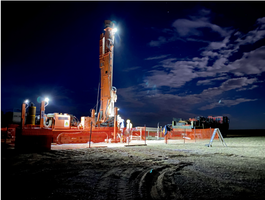
Top Diamond Drilling rig