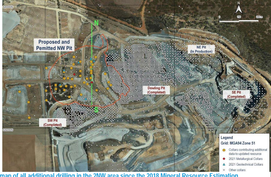
Figure 2: Location map of all additional drilling in the 2NW area since the 2018 Mineral Resource Estimation