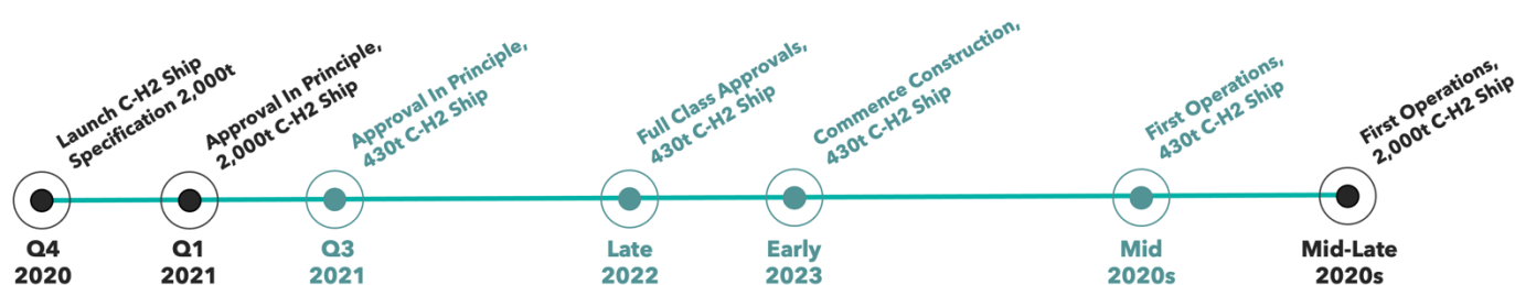
FIGURE 1: Timeline for GEV's C-H2 Ship Development