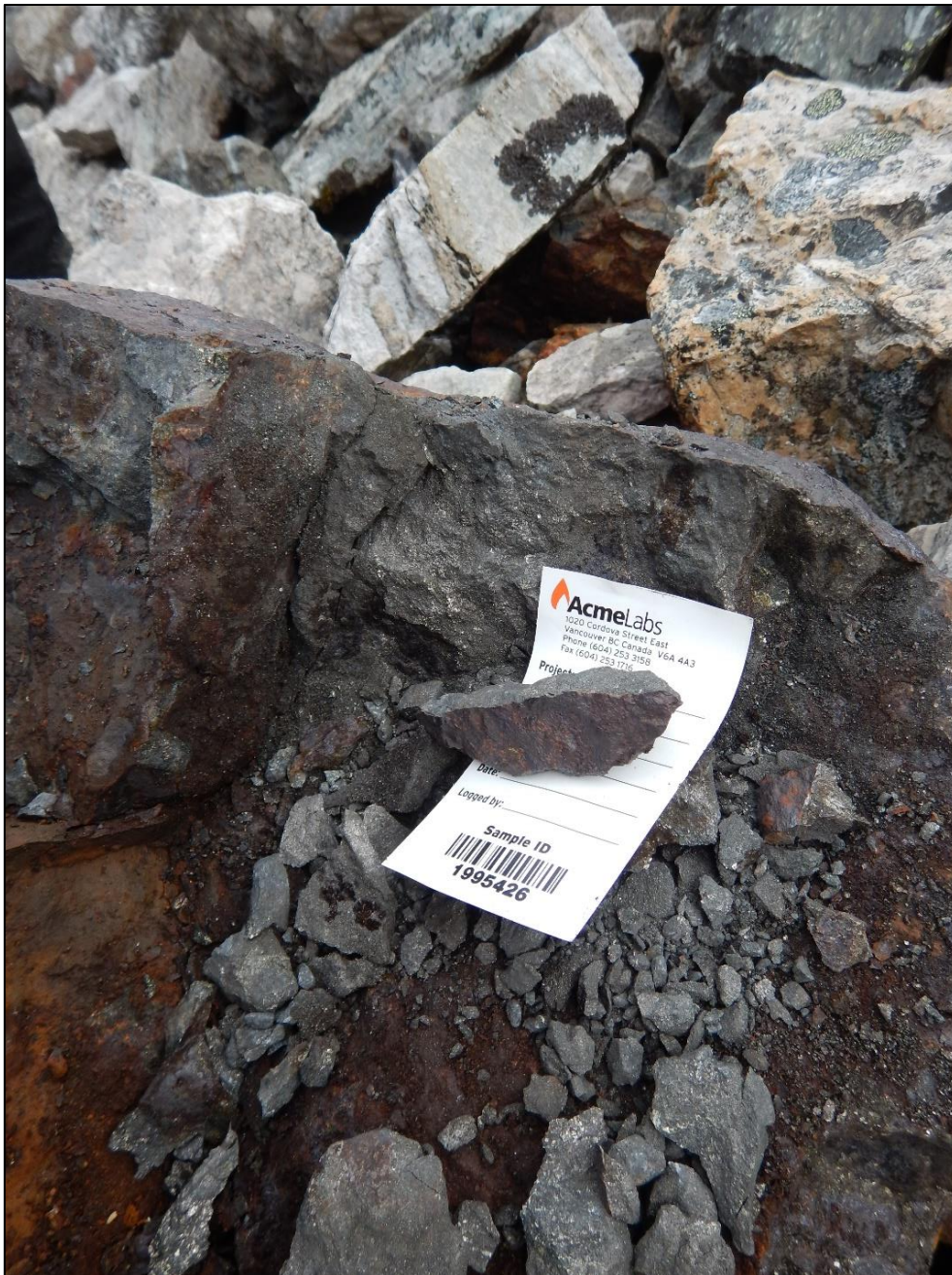
Figure 2: 2020 Discovery: Boulder of massive magnetite-pyrrhotite-chalcopyrite skarn mineralization

The Cu-Co bearing magnetite-pyrrhotite float samples have a minimal lateral dispersion of ~140 metres, indicating potential for a more laterally extensive prospect to be mapped in detail. This mapping program will be executed this field season along with investigation of a grab sample of proximal quartz vein float southwest of the MM 1-42 block that returned a value of 3.22 g/t Au (Figure 3). This Au sample may be indicative of more widespread auriferous vein mineralization in this area, which lies approximately 2.7 km southwest of the skarn mineralisation areas, thus giving the Company's geological team at Aurora Geoscience two close by however distinctly different targets to focus on.