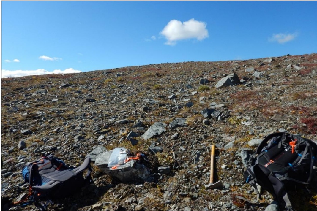
Figure 3: 2020 Sampling: Area of Sample 1459029 (3.222 g/t Au), showing lack of glacial till. Claim MM 124