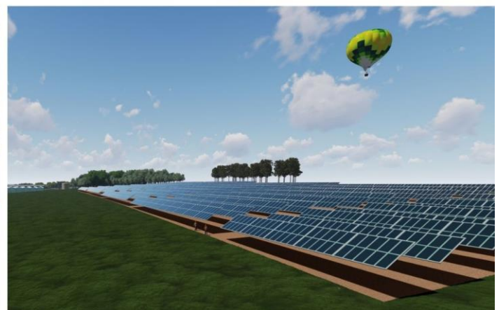
Concept render of the Cannaponics Limited facility in Collie