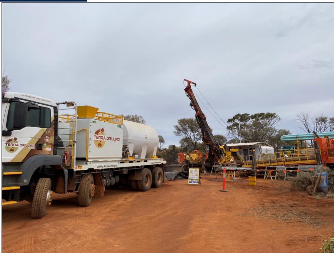
Figure 1: Drill rig at Rosie Project