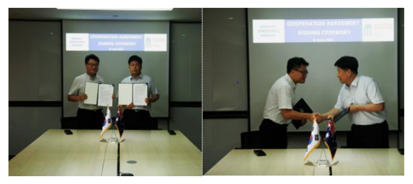
Figure: Signing Ceremony between representatives of Jin Sung International Pte Ltd and Macarthur Minerals Limited in Seoul, Korea

Macarthur Minerals Limited (ASX: MIO) (TSX-V: MMS) (OTCQB: MMSDF) (the "Company" or "Macarthur") is pleased to announce that it has signed a Cooperation Agreement ("Agreement") with diversified Singaporeanbased conglomerate Jin Sung International Pte Ltd ("Jin Sung"), paving the way for a potential strategic investment into Macarthur's iron ore and non-iron ore assets.