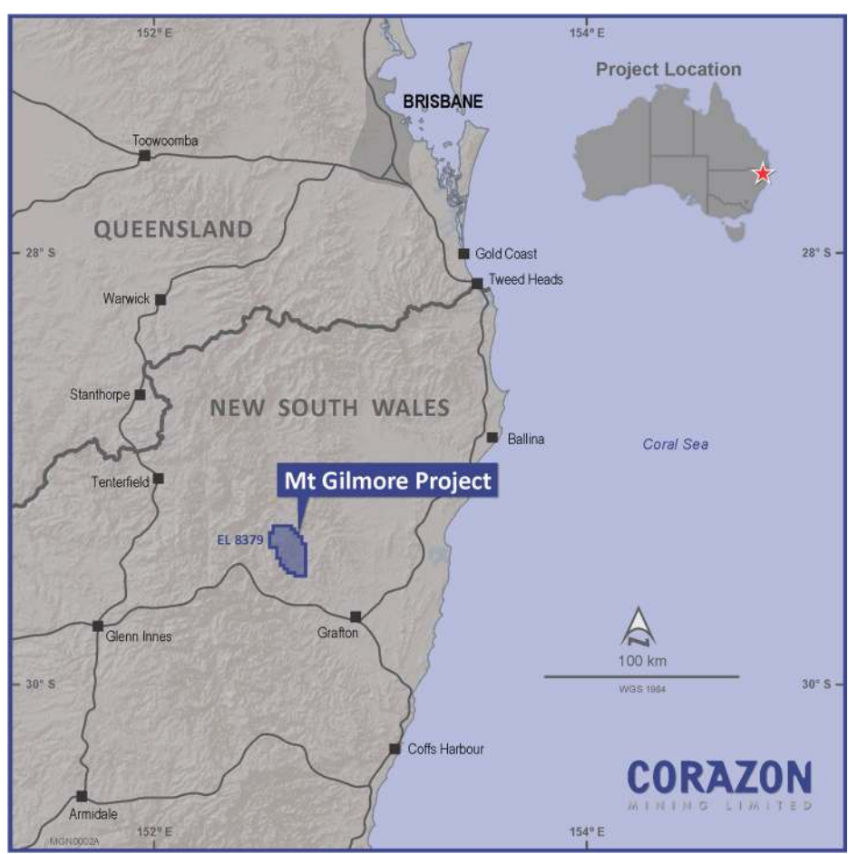
Figure 1 – Mt Gilmore Project Location Plan