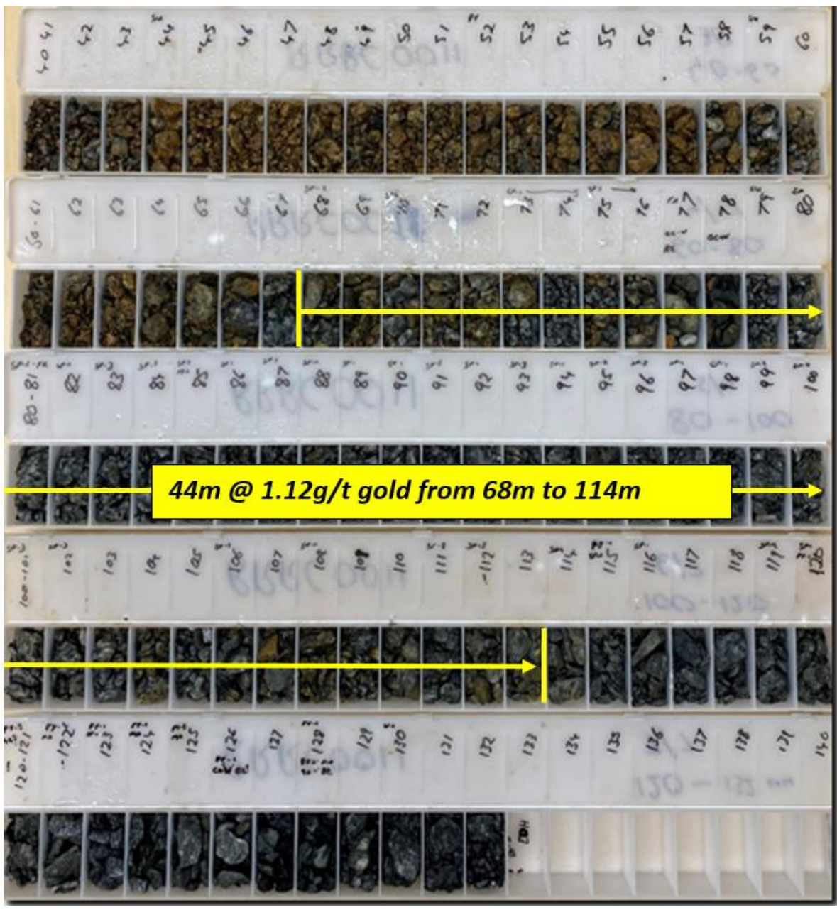
Figure 3; RC chips from RRRC0011

Only three reconnaissance holes from the recent programme were drilled into the granodiorite target as this style of mineralisation had not previously been considered a priority target.