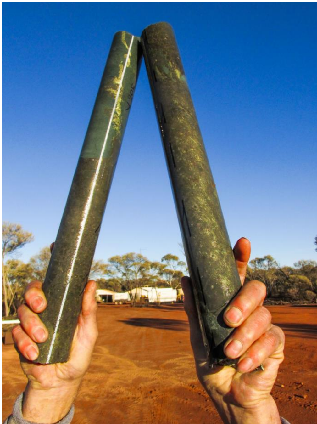
Figure 1: 70cm intersection of massive sulphide in DKDD0017 with the Rosie Camp in the background.