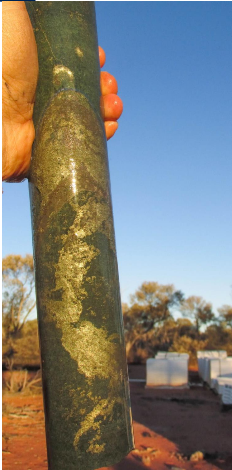
Figure 2: Pentlandite rich stringer sulphides in drillhole DKDD0017