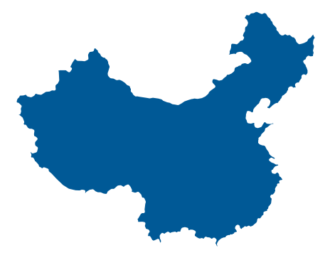
Pillar 2: new territories

New territories: Selling into China, expanding US operations and targeting South Korea and Europe