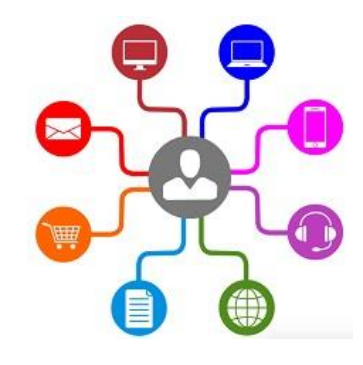
Pillar 3: new sales channels

Establishing new distribution agreements - selling through retail stores, marketing to healthcare providers and establishing cross-border ecommerce platforms in China