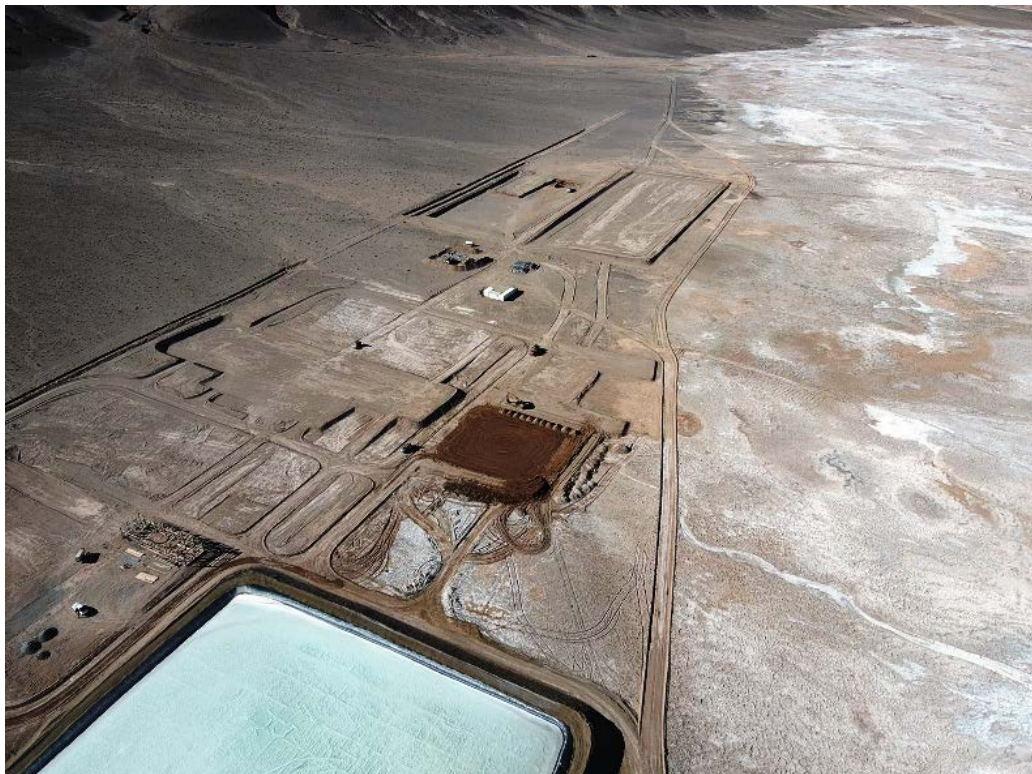
Figure 2. Rincon Lithium Project – 2,000tpa Operation Site Works in Progress