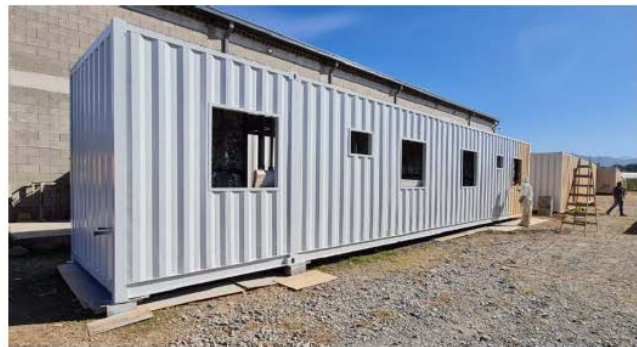
Figure 5. Rincon Lithium Project – 2,000tpa Operation Works in Progress (camp construction works)