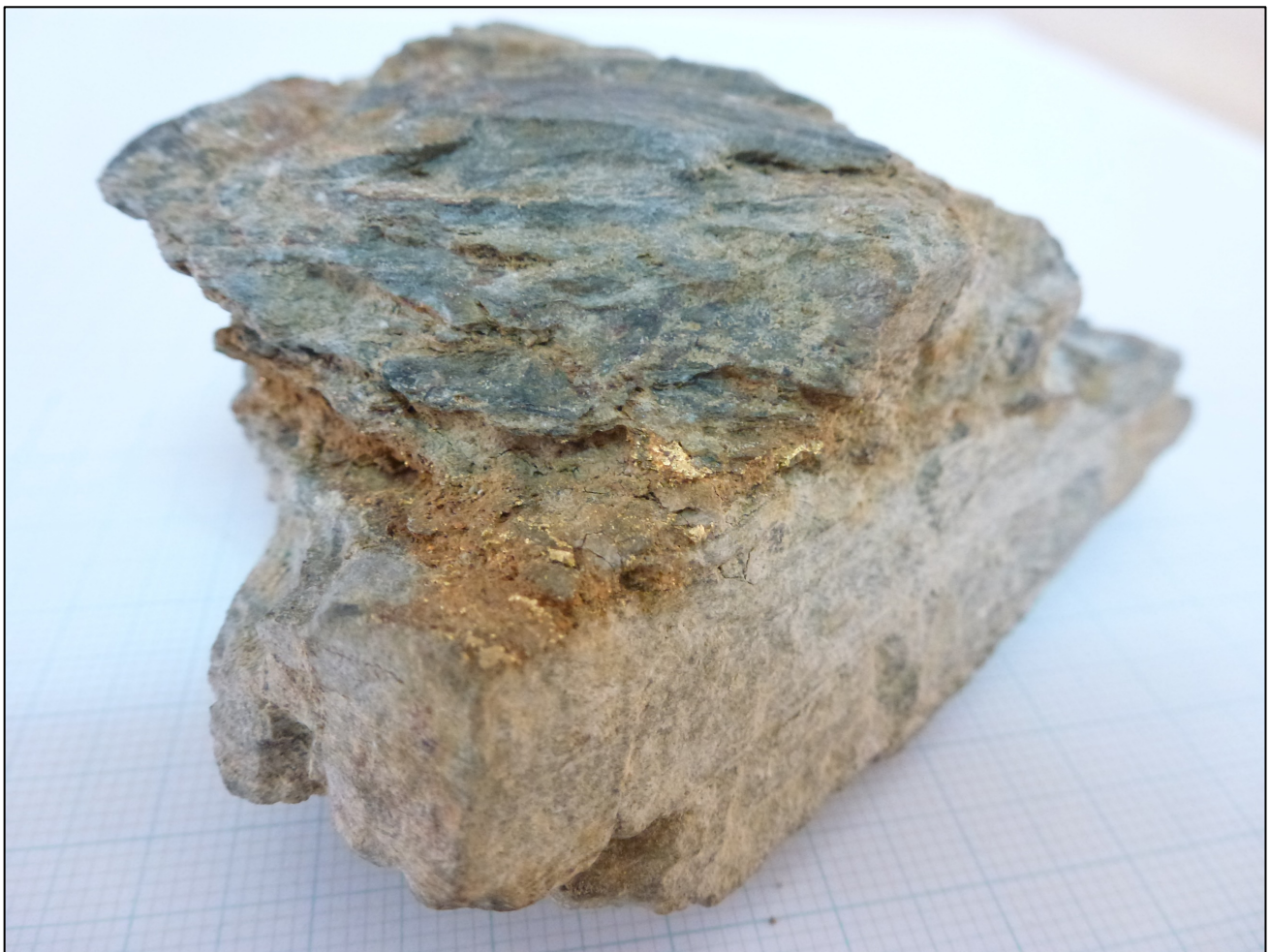
Figure 3. Hand specimen of mineralisation from the Kom Lodes with coarse, visible gold. A rock chip sample of this material assayed 818g/t gold.

For the next few months, the Company will focus its exploration effort on the Kada Gold Project in Guinea which has all-weather access and where the maiden Mineral Resource drill-out is expected to continue into the rainy season.