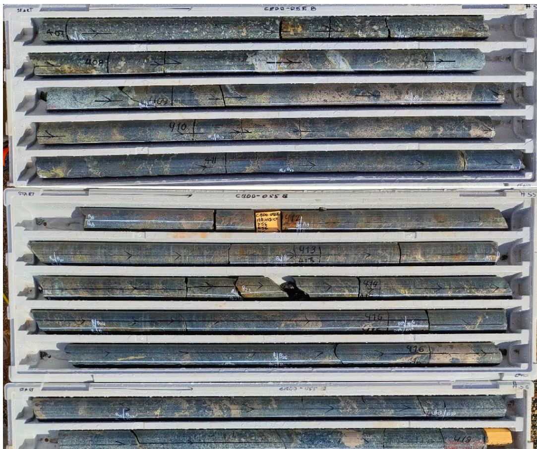
Figure 1: Massive to globular nickel-copper-iron sulphides in diamond drill hole CBDD055B at 407m to 418m.