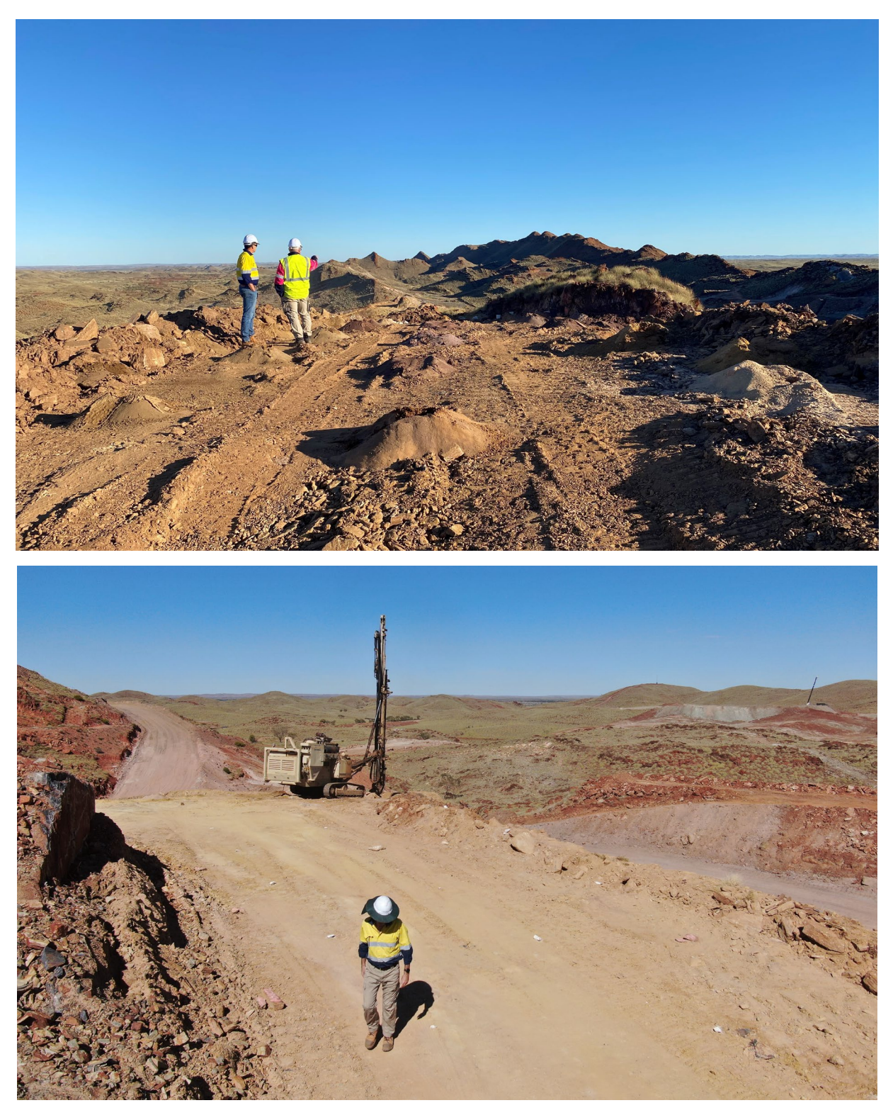
Figure 4: Blasthole Drilling