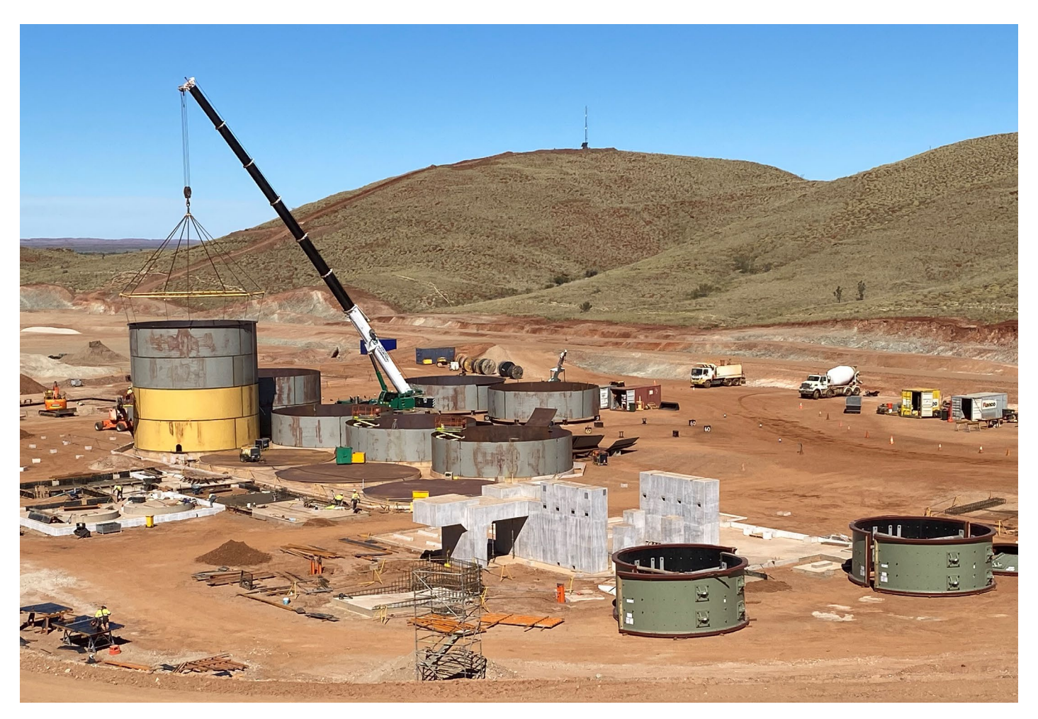
Figure 3: SAG Mill on Site