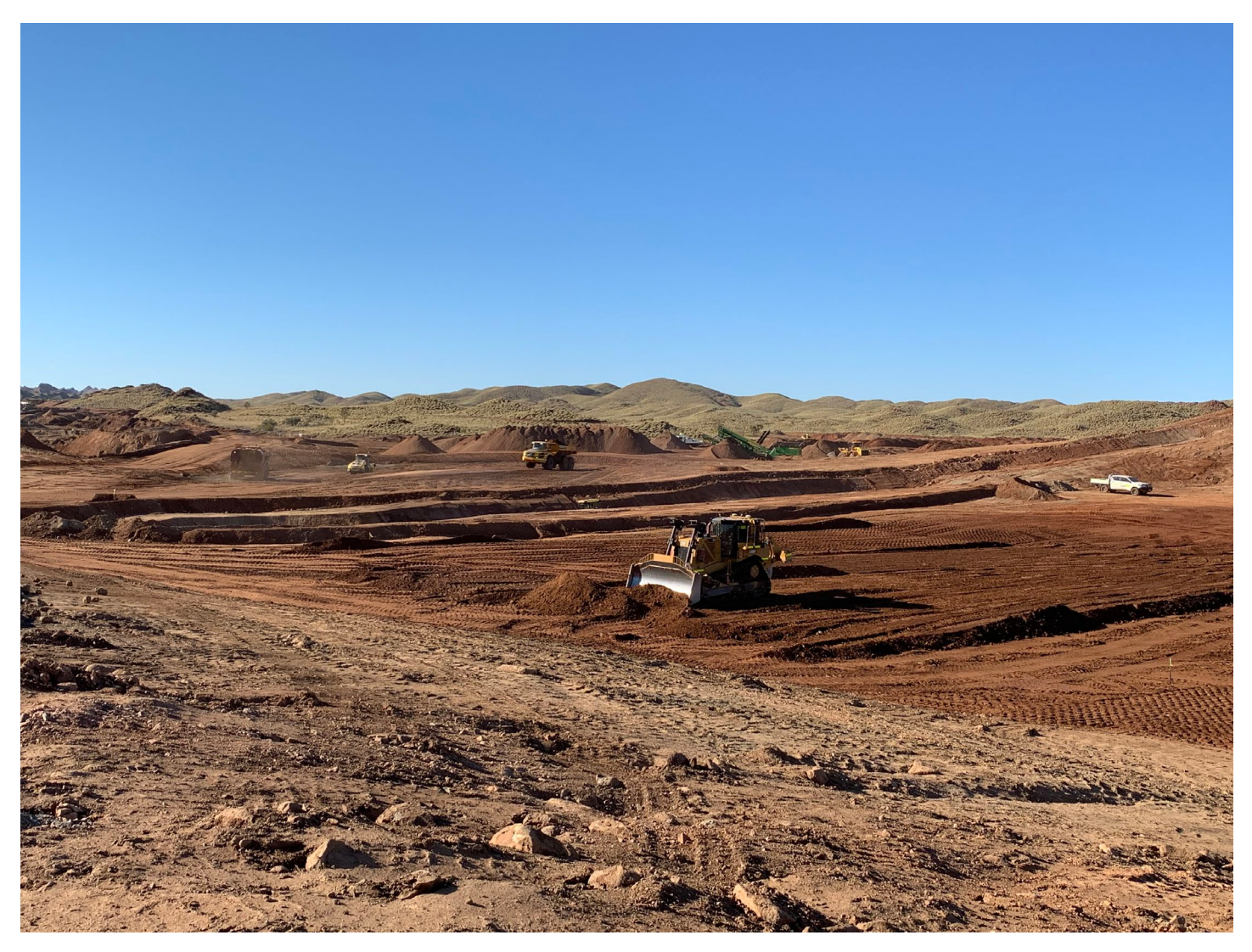
Figure 5: Tails Dam foundation preparation

This announcement has been authorised for release by the Board.