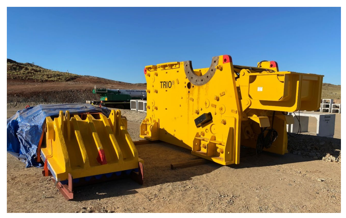
Figure 2: Crusher on Site