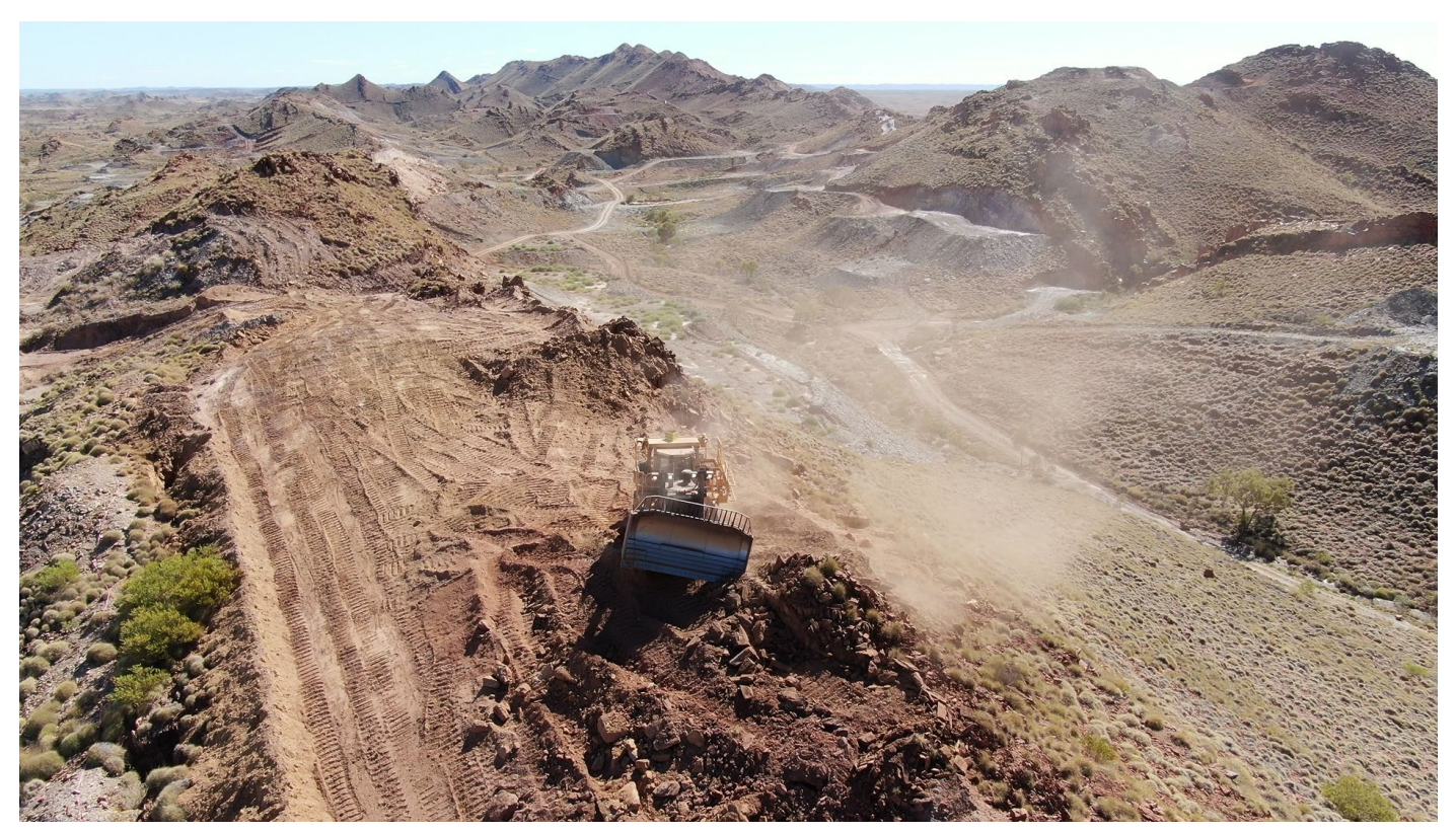
Figure 4: Pioneer Mining Underway