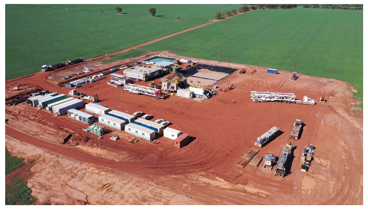
The Lockyer Deep-1 well site during mobilisation and rig-up

Lockyer Deep-1 is located within Exploration Permit EP368, a joint venture between Norwest (20%) and Energy Resources Ltd ("ERL", 80% and Operator). ERL is a division of Mineral Resources Ltd.