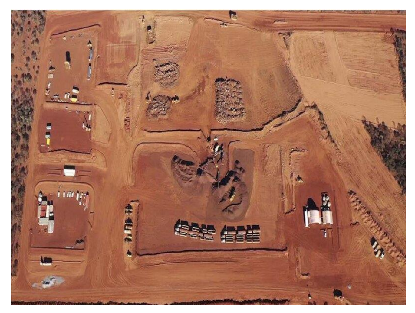
Figure 1: GWR's C4 deposit operations at Wiluna West in Western Australia.

The characteristics of the GWR product may also enable Macarthur to create a physical or virtual DSO blend product with Ularring DSO that achieves improved pricing going forward. Macarthur's iron ore at Ularring is contracted for sale to Glencore under an existing Offtake agreement entered into in 2019 (See link to TSXV announcement <u>here</u>).