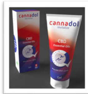
cannaDOL®0.5%, 1% 100 ml gel tubes