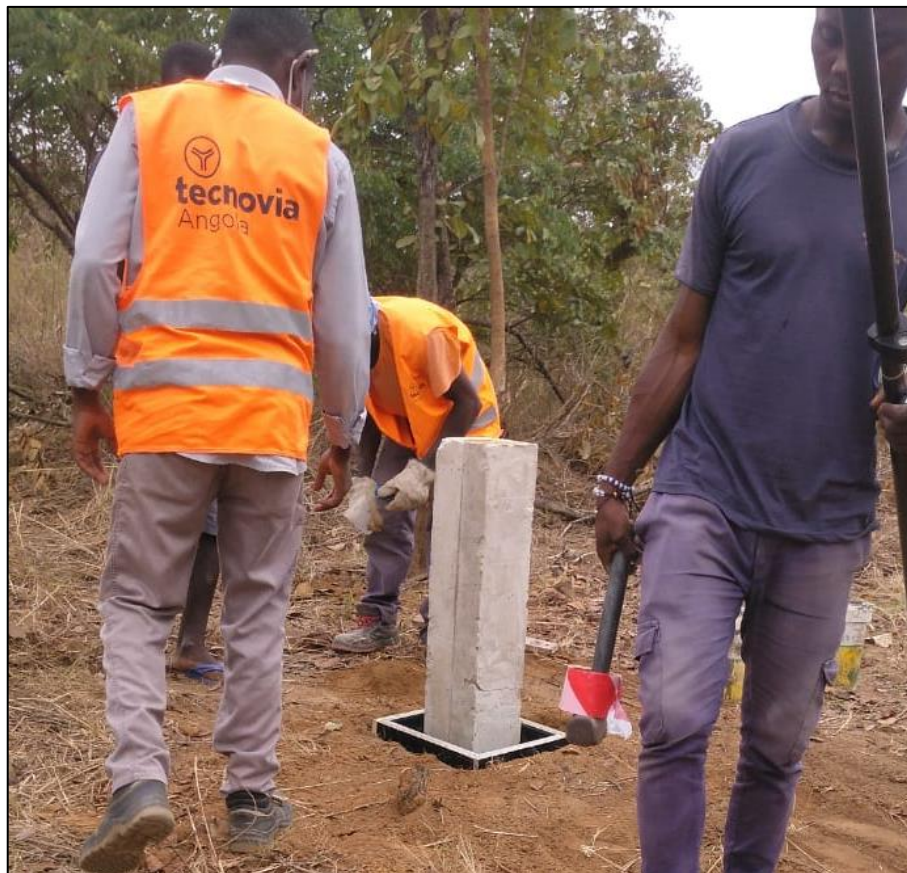
Figure 1 - Cabinda Phosphate Project, licence marker installation.