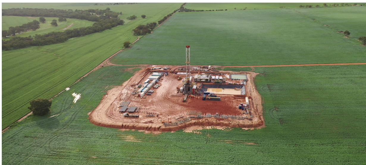
Ensign 970 rigged up at the Lockyer Deep-1 well site

The Lockyer Deep-1 well is designed to test a large structure at the Kingia and High Cliff formations, on trend with the significant discoveries made thus far within the emerging Permian deep gas play of the north Perth Basin. The well is prognosed to take 35 days to reach a Total Depth of 4,185 metres (TVDSS) and the Company's next scheduled announcement will occur when the surface casing point has been reached, at an approximate depth of 1,140 metres (TVDSS).