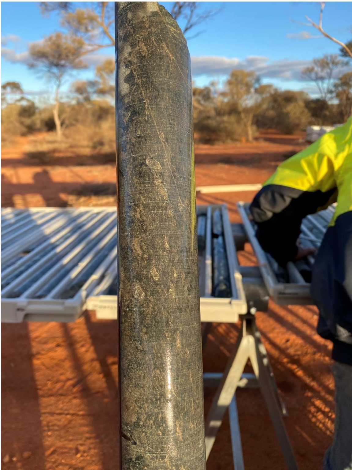
Figure 3: Heavy disseminated/blebby sulphides in drillhole DKDD0024