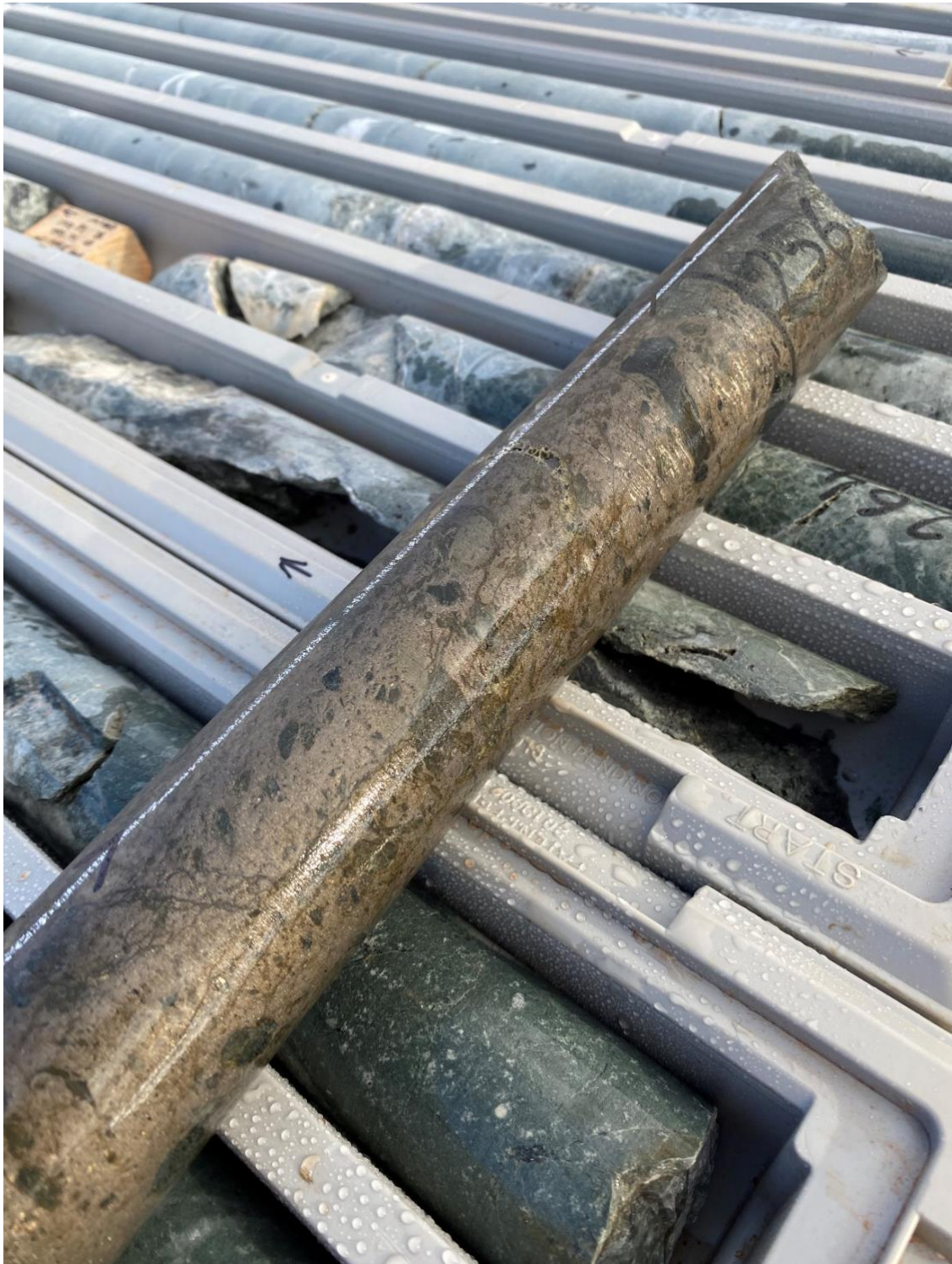
Figure 2: A close-up of the 70cm intersection of massive sulphide in DKDD0024.