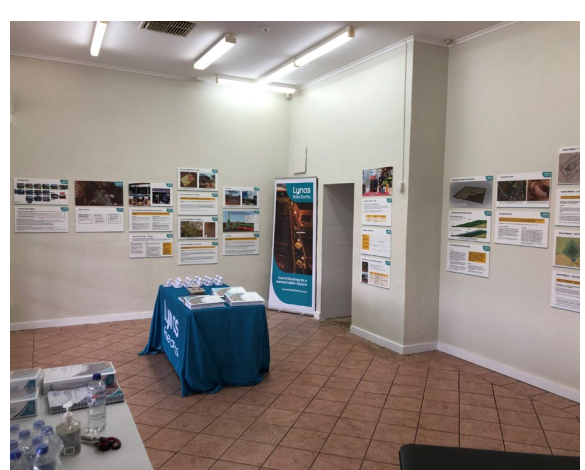
Pop-Up Information point in Kalgoorlie