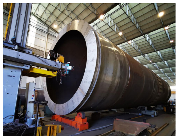
All 5 sections of kiln shell completed/close to completion