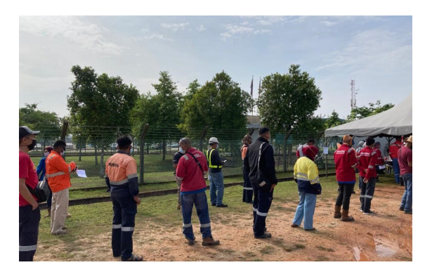
On site COVID-19 screening for staff, contractors and anyone entering the Lynas Malaysia plant