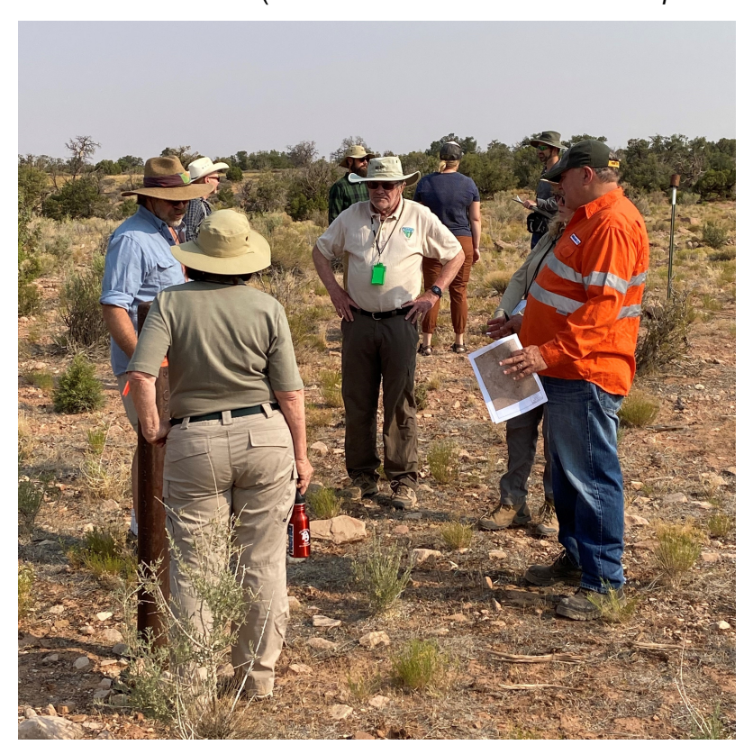
Figure 1: Representatives of the BLM and Anson at the Mineral Canyon Fed #1-3 well site.

Anson has applied to re-enter these wells to test the grades of lithium, bromine, boron and iodine contained in the Paradox Formation brines with the intent to increase and upgrade the Project's estimated JORC Resource (see ASX Announcement of 10 September 2020).