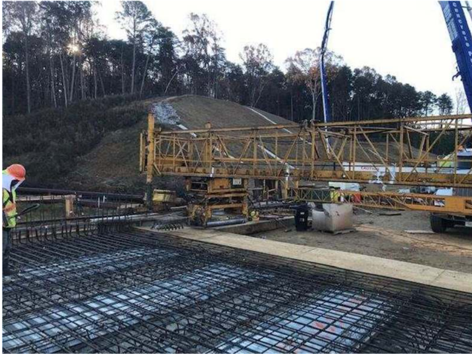
Figure 2. Bridge over Little River showing re-enforcing steel included in bridge decking