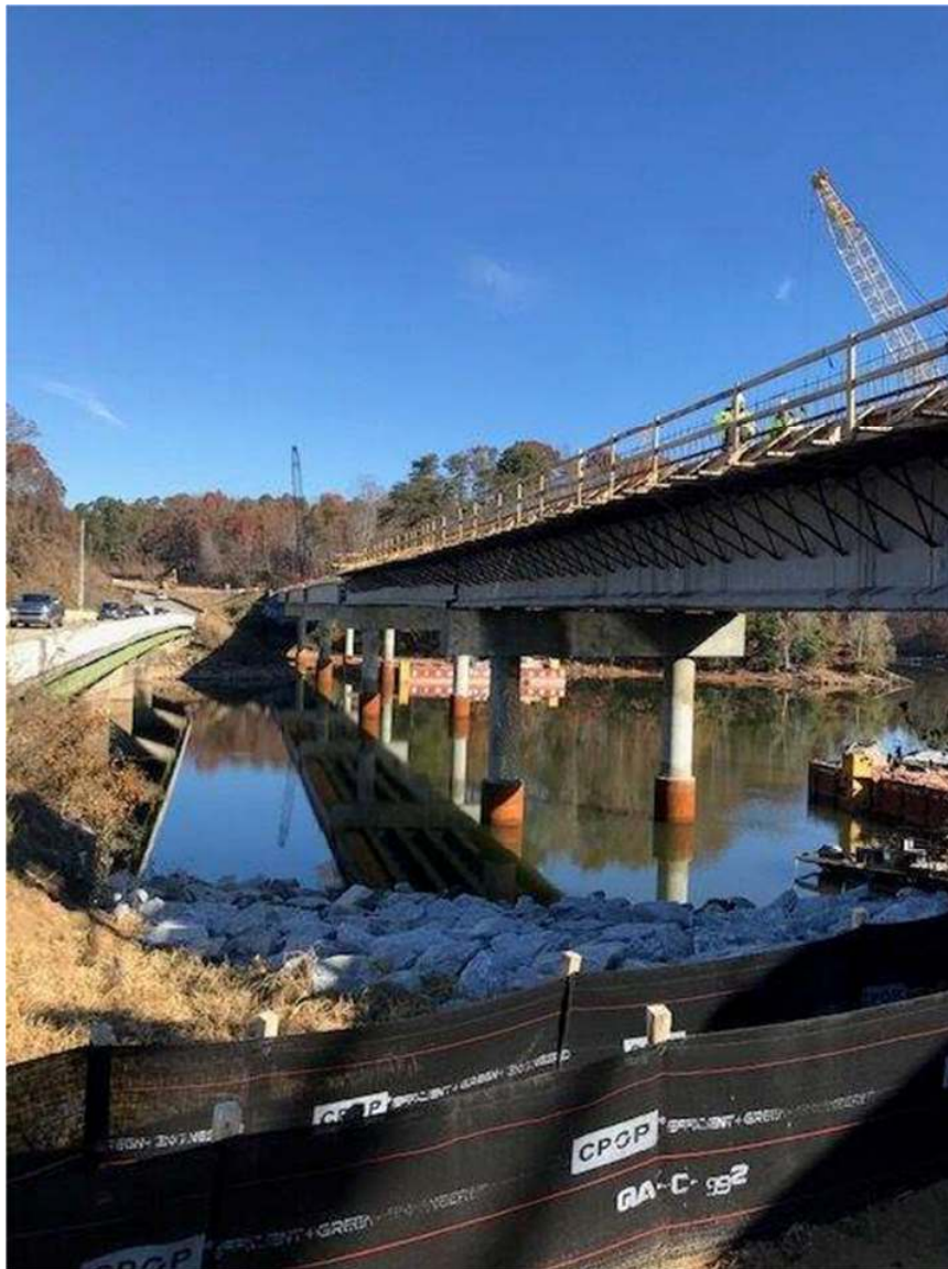
Figure 1. Bridge over the Little River

In early 2022, EdenCrete® will complete its 2 year-long GDOT field trial in the replacement of the decking on three spans of a bridge across the Little River located in Gainesville, Georgia (see Figures 1-3) (see Eden’s ASX announcement dated 26 November 2019).