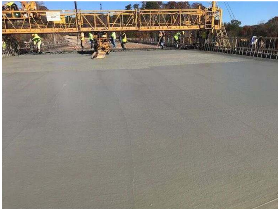
Figure 3. Bridge over Little River showing freshly lain concrete bridge decking

The successful completion and assessment of this bridge trial will afford Eden a strong opportunity to greatly increase the number and value of GDOT projects in Georgia in which EdenCrete® will be used. There are 14,750 bridges in Georgia, and all bridges are inspected every two years. As an indication of the potential significance of this trial, in 2019 GDOT spent US $509.5 million in construction and widening 65 bridges, as well as US $41.9million on bridge maintenance.