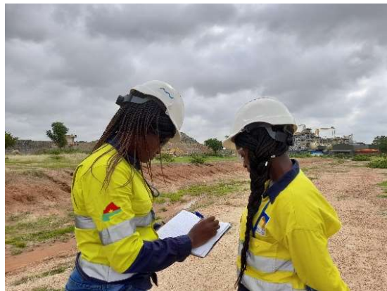
Environment team members conducting an audit