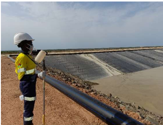
Environmental monitoring near the Tailings Storage Facility