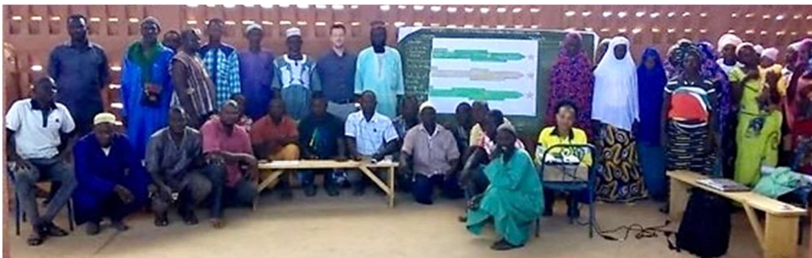
Livelihood Restoration Working Group entitlements validation meeting, May 15, 2021

A Livelihood Restoration Working Group was formed in June 2020 and formalised by decree in February 2021 to oversee the implementation of the livelihood restoration program. The working group validated the agricultural and pastoral entitlement programs on 15 May 2021. This constituted a major milestone in advancing the livelihood restoration program and paves the way for the Company to put its pilot projects, extensive consultation, and the research into action. The working group consists of a male and female representative from each of the 14 project affected communities.