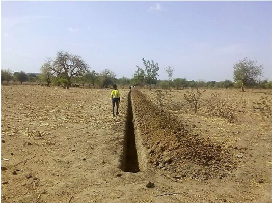
Construction of livestock watering point

WAF’s targeted social investment projects have included a number of workshops and training administered to our communities in collaboration with local organisations, including: