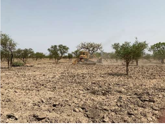
Soil improvement program in preparation for wet season