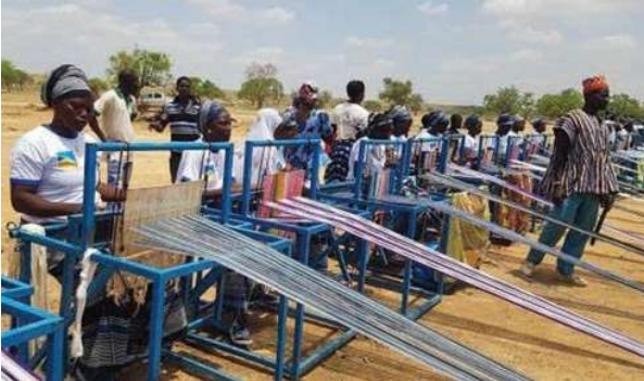
Awards ceremony for completion of weaving workshop