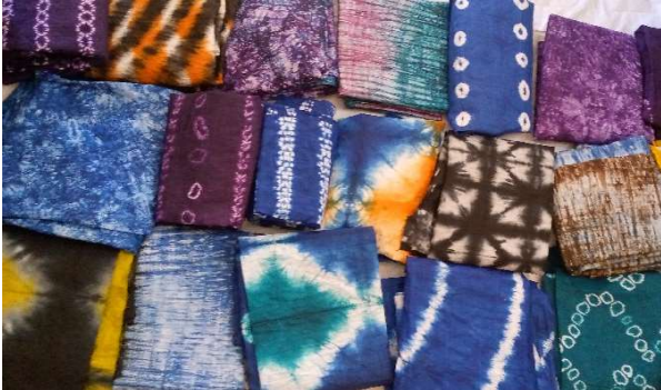
Colourful cloth dyed by the program graduates