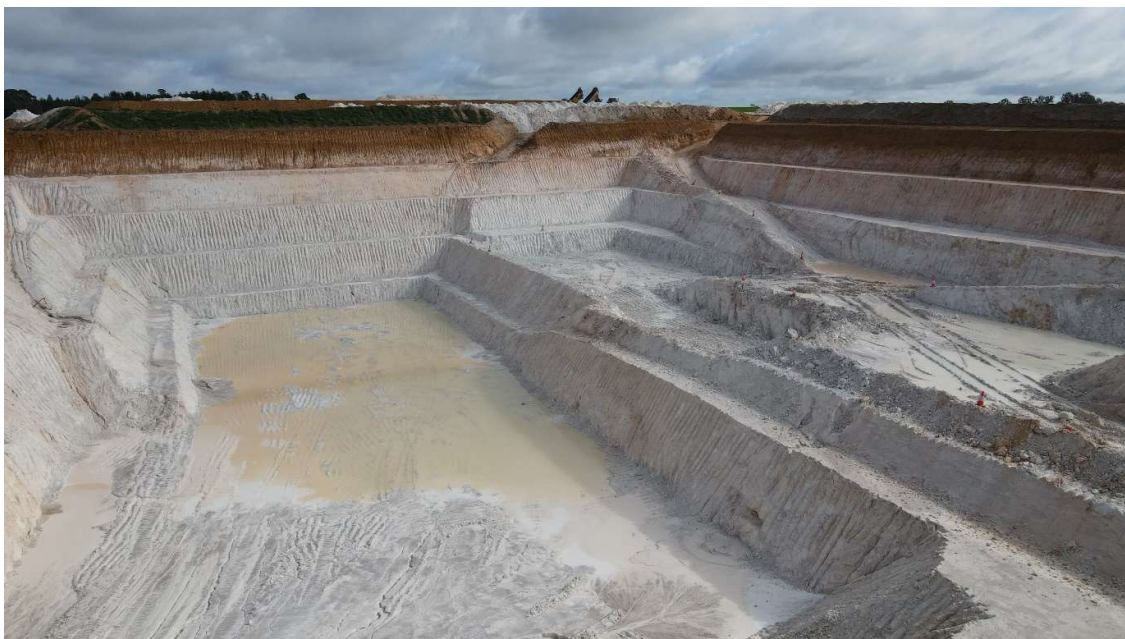
Figure 3. High purity Kaolin at Wickepin