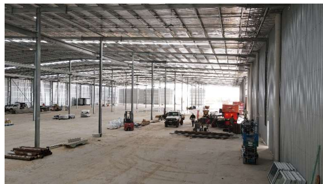
Figures 1 & 2. Stage 1 Building works continue at Wickepin with 92% of build complete.