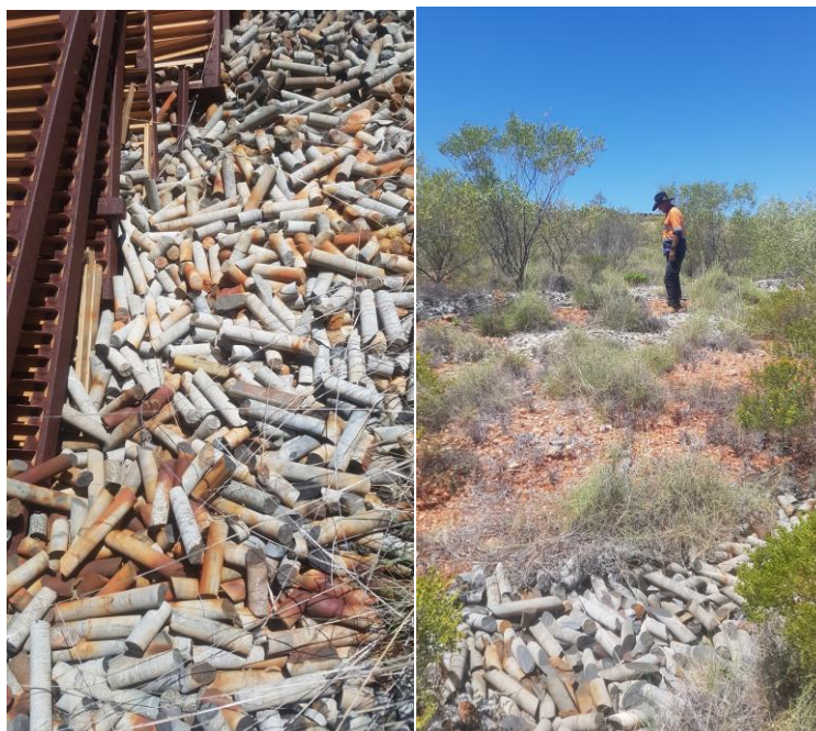
Figure 3: Historical core yards destroyed in the 1980s remain at Mons Cupri

Anax is maintaining and continuously improving the Whim Creek drilling database compiled by Venturex. However, there may have been historical drill holes that were missed from this compilation because of the destruction of core yards in the Pilbara in the 1980s. GSWA publication Report 70: Mineral Occurrences and Exploration Potential of the West Pilbara 2 notes that magnesium-rich units of the Mount Negri Volcanics were targeted for base metals in the 1970's. However, the "core shed disasters of the mid-1980s at Ruth Well, Sherlock Bay and Mons Cupri caused major setbacks to mineral exploration and research on base metals and nickel mineralisation in the west Pilbara." 2 Evidence of this remains at Mons Cupri where historical core has been found dumped in extensive "core graveyards" (see Figure 3, below).